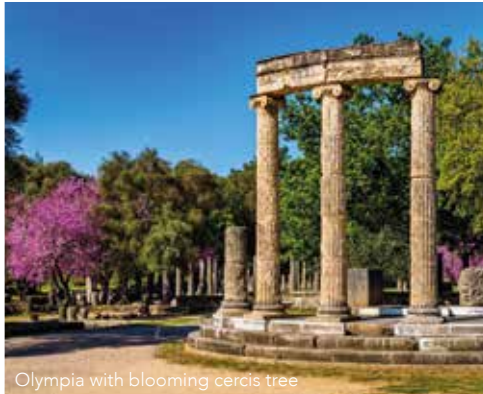
Olympia with blooming cercis tree