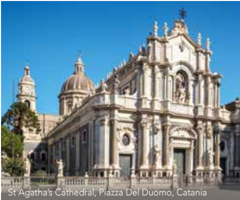
St Agatha's Cathedral, Piazza Del Duomo, Catania