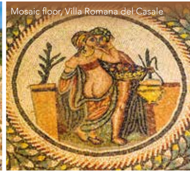
Mosaic floor, Villa Romana del Casale