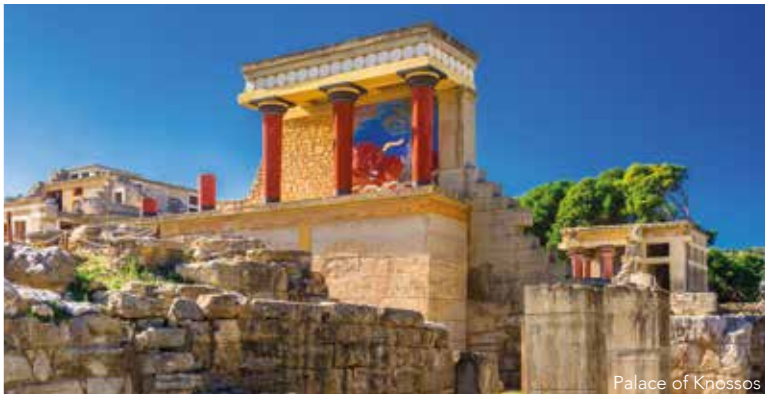
Palace of Knossos

of Pantanassa, with its brilliant frescoes. Alternatively, join a scenic drive to the Mani Peninsula visiting the villages and enjoying the wonderful views along the coast. Visit Aeropoli, named after Ares, the God of War, for its role in the War of Independence. Here we find tower houses, constructed with field stones, that are distinct from the traditional blue and white buildings that characterise many Greek villages. Following lunch on board, enjoy a leisurely afternoon to explore Gythio at your own pace, maybe take a walk on the promenade, visit the lighthouse or people watch from a waterfront taverna.