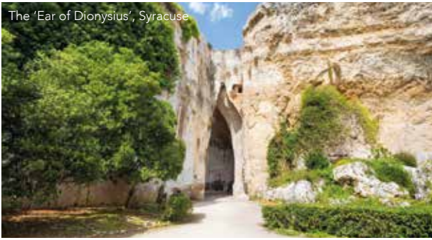
The 'Ear of Dionysius', Syracuse