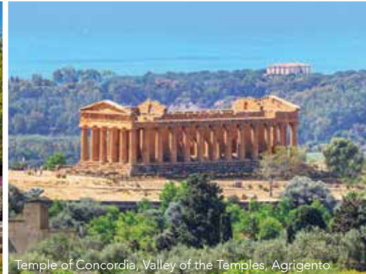
Temple of Concordia, Valley of the Temples, Agrigento