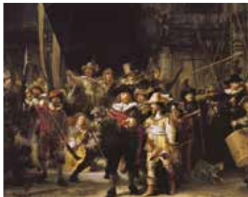
Rembrandt's 'The Night Watch' - Amsterdam

Today we explore Southern Zeeland, starting in the 13th century town of Veere. Formerly a seaport but now within a lake due to the Delta works carried out in the 1960s, it is a charming place with well-preserved houses and a marina. Enjoy free time here to explore at your own pace. Return to the ship and sail on to the lovingly restored Medieval town of Middelburg whose 12th century abbey is one of the oldest in the Netherlands. Join an afternoon guided walking tour on arrival. Sail this evening to Rotterdam.