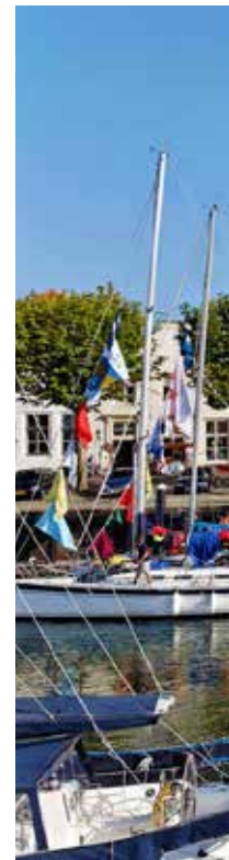
The Marina and Townhall, The Hague