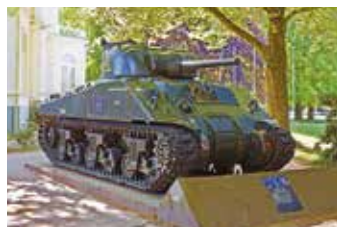
The 'Hartenstein' Airborne Museum, Arnhem

numerous and varied adult education groups and through her work at the Tate Gallery, National Portrait Gallery and the National Gallery. She is the author of the forthcoming book "Great Themes in Art".