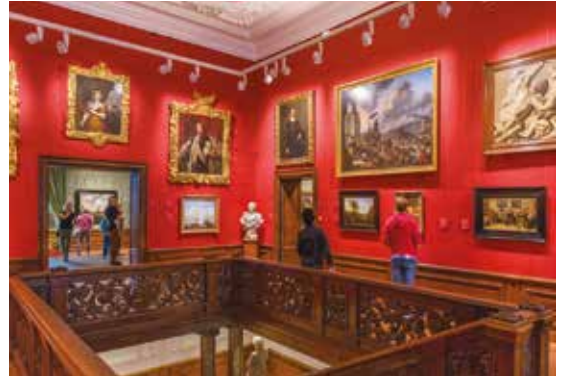
Dutch Golden Age paintings in the Mauritshuis Museum, The Hague