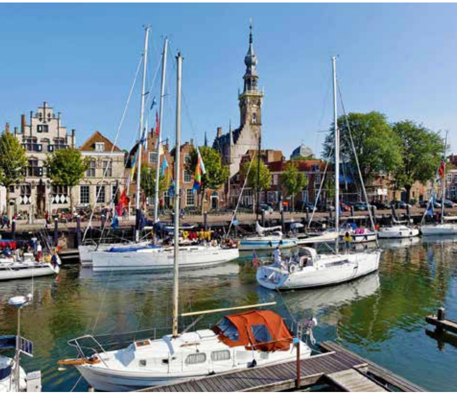
Harbour in Veere