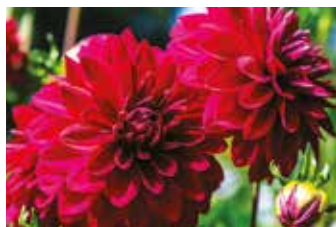
Leiden's Hortus Botanicus Gardens