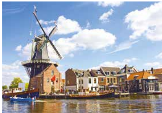
Windmill de Adriaan, Haarlem