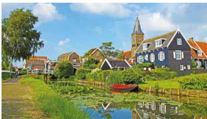
The pretty village of Marken

Day 8 Leiden. After breakfast we depart for the vibrant city of Leiden, a treasure trove of narrow streets and canals, lined with beautiful 17th century buildings, including ancient almshouses. On our walking tour we will see the old harbour, Beestenmarkt square and the charming Weddesteege, where the world-famous painter Rembrandt was born. We continue with a visit to the