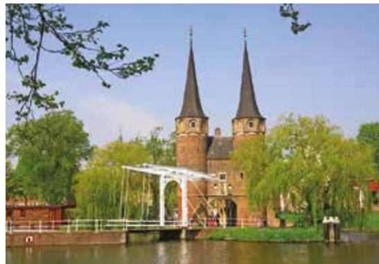
The East Gate and Bridge, Delft

April is the ideal month for such a journey, the bulbs will be at their best and the landscape touched by the arrival of spring. The itinerary we have designed is, we believe, a perfect mix of horticulture, history, art and Dutch lifestyle and makes for a colourful and endlessly interesting cruise.