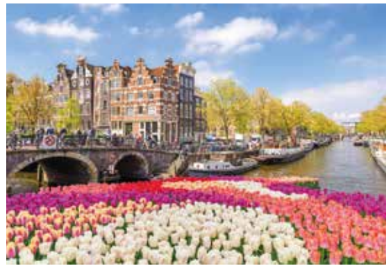
Spring flowers and Amsterdam's canals