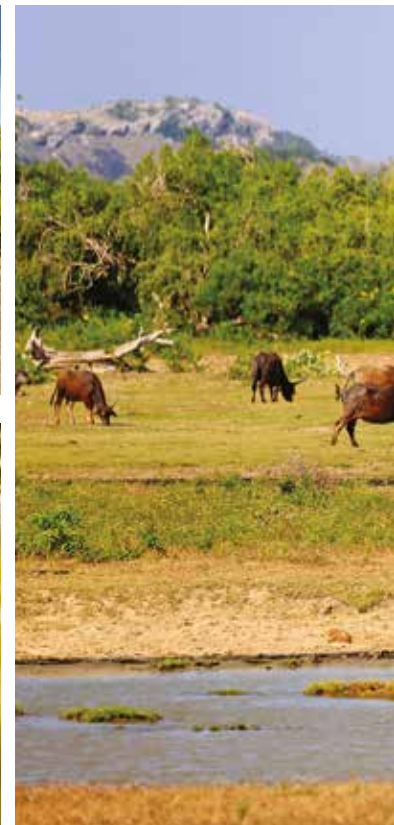
Elephant and Water Buffalo, Yala National Park

Day 5 Dambulla & Habarana. This morning we visit the Dambulla Cave Temples. This UNESCO World Heritage Site is a vast cave complex that dates back to the 1st century BC when it was converted into a temple and it is still regarded as one of the most important Buddhist monasteries. As we explore the complex of five caves, admire the rock ceiling which is the largest collection of paintings in Sri Lanka within a cave temple and wander between the 150 Buddhist statues that stand so well preserved within the cave walls. Later we will visit a village in Habarana, in the Cultural Triangle of Sri Lanka, where we will have the opportunity to interact with locals and experience daily life and the scenic views of Hiriwadunna Lake. Here we will enjoy a typical Sri Lanka lunch in the village. (B, L, D)