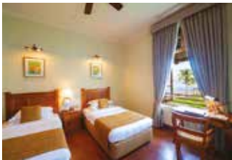
Superior Twin Room