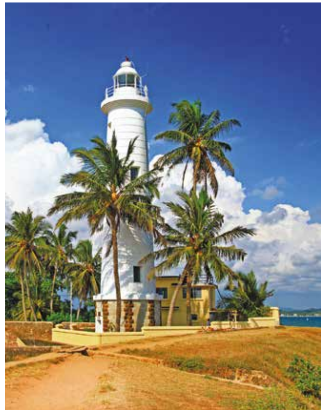
The lighthouse at Galle Fort

must on any Sri Lankan itinerary. As an alternative to our journey by road, we may board the train at Peradeniya Station and take a scenic train journey to Hatton and then transfer by road to our hotel. This ride by local train is one of the most picturesque railway journeys in the world. We pass through lush green tea estates and mist covered mountains as we journey along the winding tracks. Upon arrival in Hatton check in to our hotel and enjoy an afternoon at leisure. (B, D)