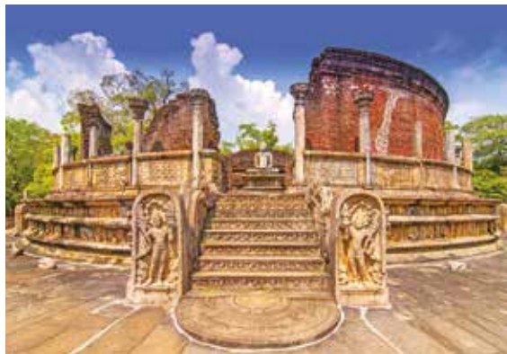
The ancient Vatadage at Polonnaruwa