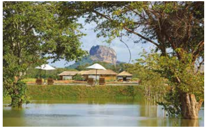
Garden and pool area with stunning views of Sigiriya Rock