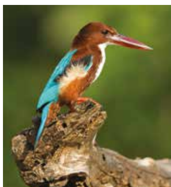
White-throated kingfisher, Bandara National Park