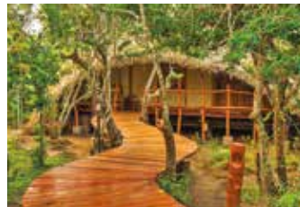
Cabin entrance and walkway