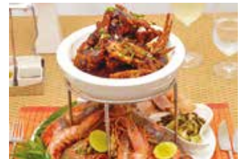
Local seafood delicacies