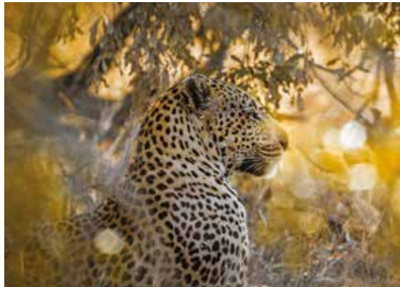
Leopard, Yala National Park