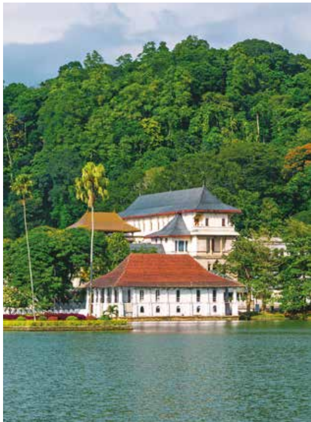
Temple of the Tooth at Kandy