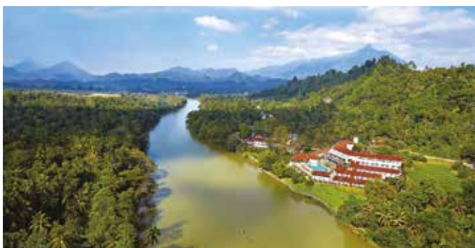
The hotel on the banks of the Mahaweli River

The Water Garden Hotel is a beautifully laid out, boutique hotel with stunning views of the ancient rock fortress of Sigiriya. The thoughtfully landscaped grounds have been inspired by the water gardens of ancient fortresses, filled with pathways and mature trees, allowing you to enjoy the region's landscapes even when you have returned to the hotel. There are just 30 exceptionally appointed and spacious villas scattered throughout the gardens, all with luxurious interiors and in naturally beautiful settings. This wonderfully tranquil atmosphere extends to the main areas of the hotel where the iconic Sigiriya Rock sits as a backdrop to the hotel's infinity pool that overlooks the gardens. The main restaurant is traditional in style with high quality local produce offering local and international cuisine.