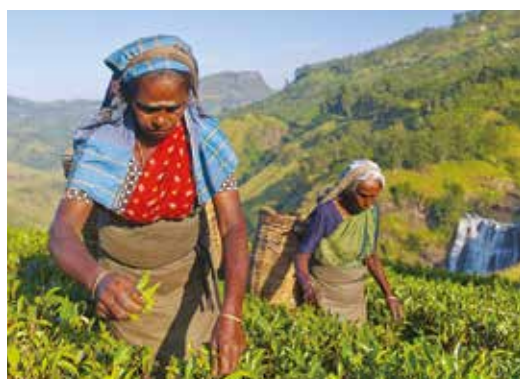
Tea picking, Ella

Day 9 Kandy to Hatton. After breakfast this morning we make our way to the heart of Sri Lankan hill country for our two night stay at the Argyle Hotel. The hotel is set in the heart of Sri Lankan hill country where acres of tea estates merge with beautiful old English architecture. The region is home of the famous Ceylon tea and the rolling mountains are a carpet of velvety green tea plantations, interspersed with gushing streams and tumbling waterfalls. The salubrious climate and misty glens of the region make it a