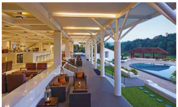
Lower Lounge and Pool

Influenced by the old and inspired by the new, Cinnamon Citadel has fused chic design with the rich heritage of this ancient kingdom to breathe new life into the most stylish hotel in the hills of Sri Lanka. The Cinnamon Citadel is an ideal retreat for those seeking the treasures of this ancient city and desiring rest and relaxation in a peaceful setting. The 93 superior rooms, which measure 423 square feet are furnished to a high standard. The interiors take on a mix and match of heritage red, with mustards and crimson to highlight royalty and majesty for which Kandy is renowned. There is a restaurant, bar and café on-site and an outdoor swimming pool from where you can enjoy the breathtaking view of the Mahaweli River that flows along the periphery of the resort.