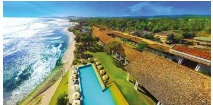
The colonial style Fortress Resort overlooking the Indian Ocean