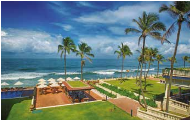
South Lawn overlooking the sea

For our escorted tour of Sri Lanka we have selected some of the finest accommodation available and will be staying at the following properties: