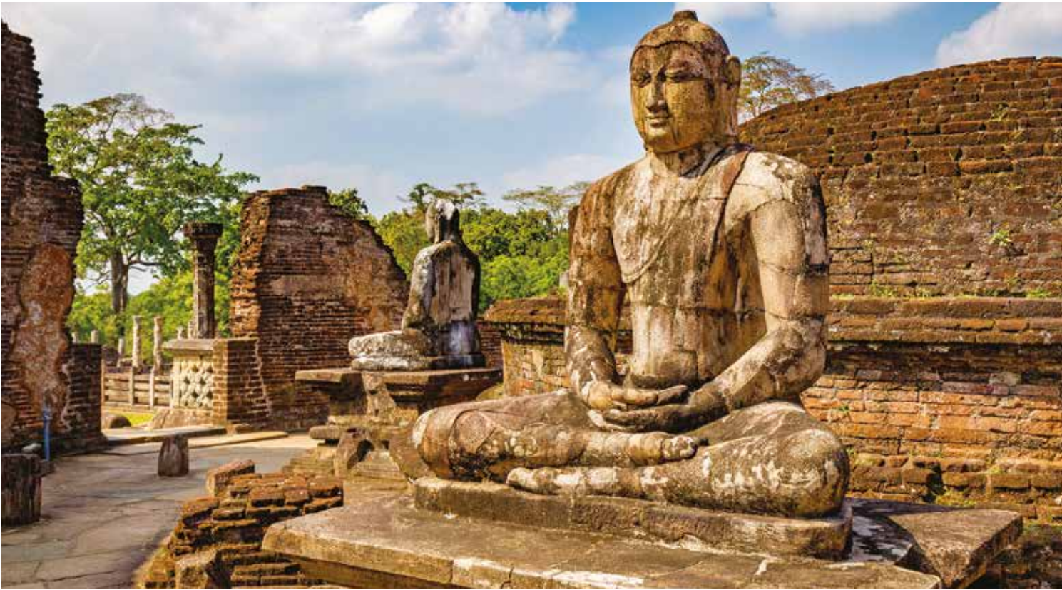
Buddha statue at Polonnaruwa

Marco Polo described Sri Lanka as the finest island of its size in the world when he arrived there in 1265, while successive waves of Indian, Arab and European traders were seduced by reports of rare spices, precious stones and magnificent elephants. Although tiny in size compared to its neighbour India, Sri Lanka has a wealth of both ancient and natural sites which we will explore during this escorted tour including no less than five UNESCO World Heritage Sites in Galle, Kandy, Sigiriya, Polonnaruwa, and Dambulla. Over the course of two weeks we will take an in-depth look at this remarkable country with its diverse landscape of beautiful beaches, lush tea plantations, rolling hills and forests which are scattered with intricately carved stone monuments.