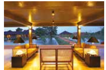
Main Pavilion and Lounge