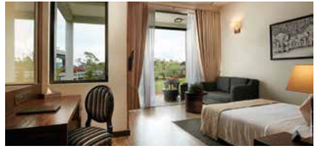
Bruce Room - lower level

The Argyle is a luxurious hideaway nestled among the emerald green tea blankets of Sri Lanka's hill country. The hotel is spread across three acres in the city of Hatton with magnificent views of the iconic Adam's Peak in the distance. There are 38 uniquely styled, comfortable rooms and suites offering luxurious modern amenities and the most spectacular views. We will be staying in the beautifully appointed Bruce Rooms; the upper level rooms offer glorious sights of the surrounding hillside from a private balcony while the lower level rooms offer a terrace with access to the vast, enclosed garden and elevated swimming pool. The hotel features a restaurant, named Queen Mary's Dining Room, offering an extensive range of culinary delights and, when not exploring, the heated swimming pool is the perfect place to relax and unwind in the cool climate of Hatton.