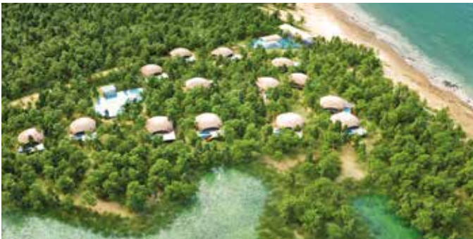
Cabins set amongst the sand dunes