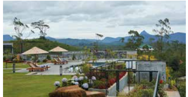
Garden area & outdoor pool