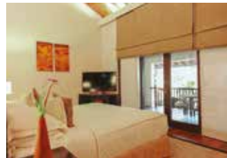
Fortress Balcony Room