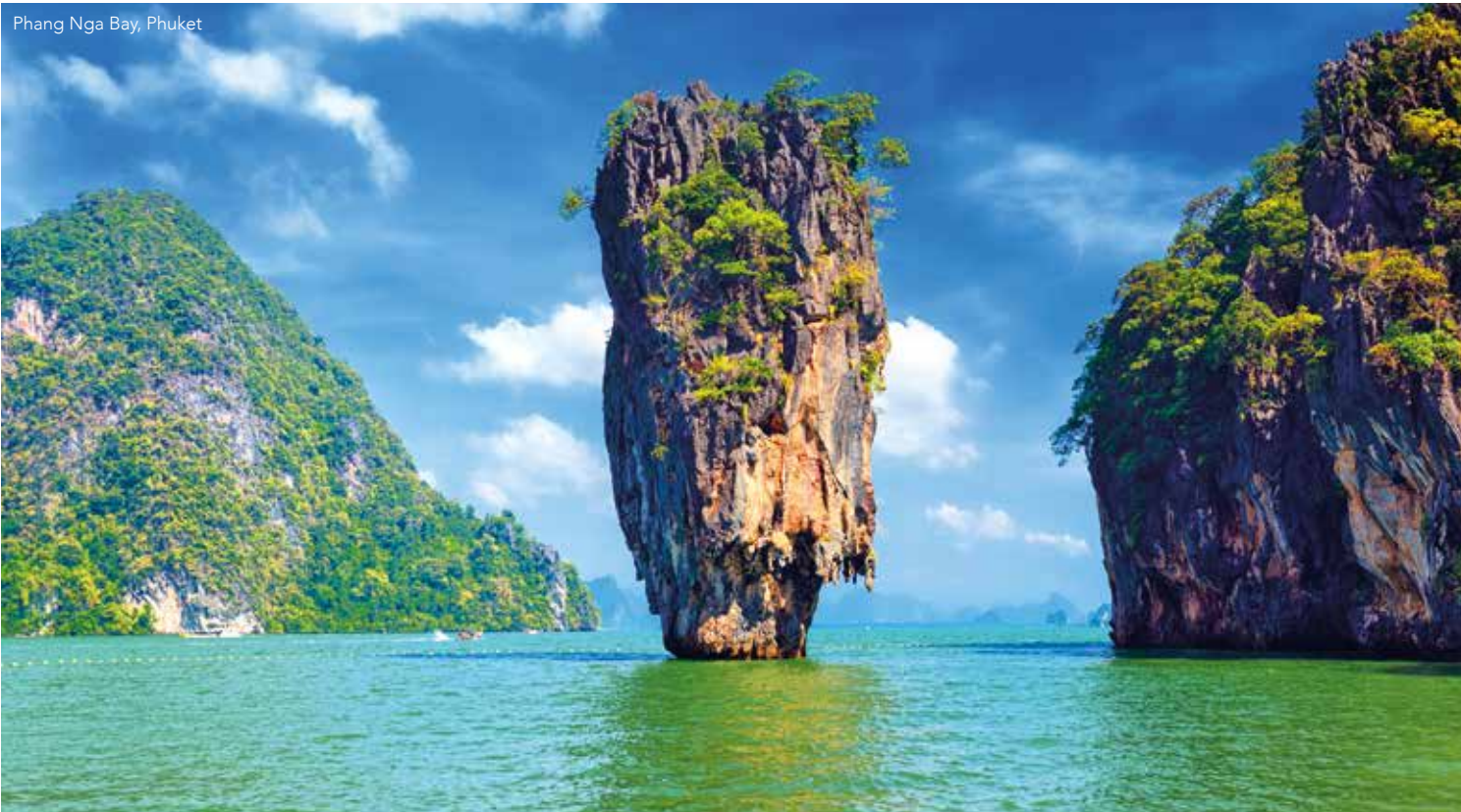
Phang Nga Bay, Phuket

There are countless tours available of Southeast Asia which fly from one city to another, abruptly introducing you to cultural and architectural contrasts that can be bewildering and, in many ways, unfulfilling. In our view, there are regions of the world which need to be absorbed slowly and at eye level in order for the experience to be enjoyable and enlightening and Southeast Asia is one of those regions. Join the all-suite MS Island Sky for the opportunity to journey in comfort whilst exploring Thailand, Malaysia and Singapore for what promises to be a great adventure with just over 100 fellow, like-minded travellers.