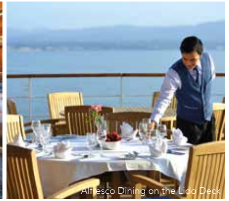
All-escos Dining on the Lido Deck