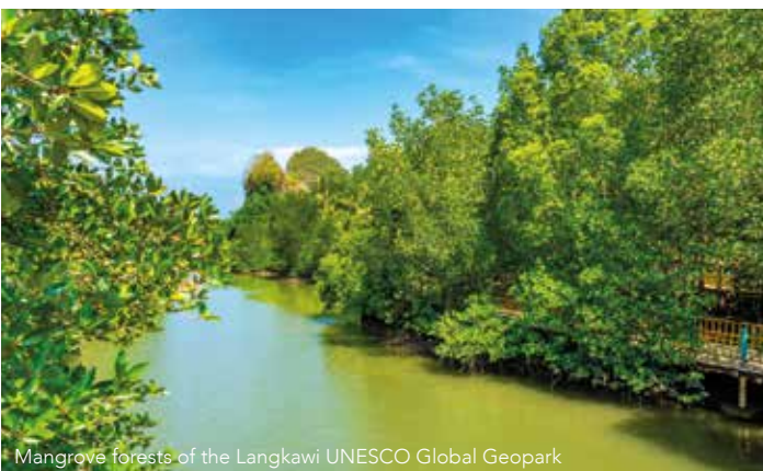
Mangrove forests of the Langkawi UNESCO Global Geopark

Afloat and ashore, our voyage will be filled with unforgettable images and experiences, heritage-filled cities, tropical forests with endemic flora and fauna, remote islands and white sand beaches. Exploring this remarkable region from the comfort of a small ship provides a uniquely rewarding experience, and we hope you will join us for this wonderful voyage through the heart of Southeast Asia.