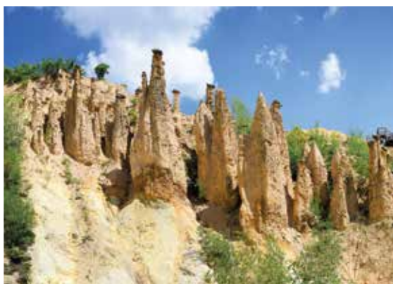
Rock formations, Devil's Town