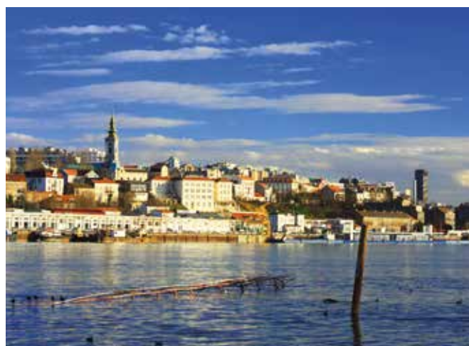
Old Belgrade from the river Sava

Situated in the heart of Nis adjacent to the main square, the city centre with bars and restaurants is just a short walk away. Renovated in 2019, this landmark hotel features 69 modern air-conditioned rooms that include 24-hour room service, tea station and espresso coffee machine, television and complimentary Wi-Fi. The hotel features an international restaurant, lobby bar and an on-site spa with sauna and fitness centre.