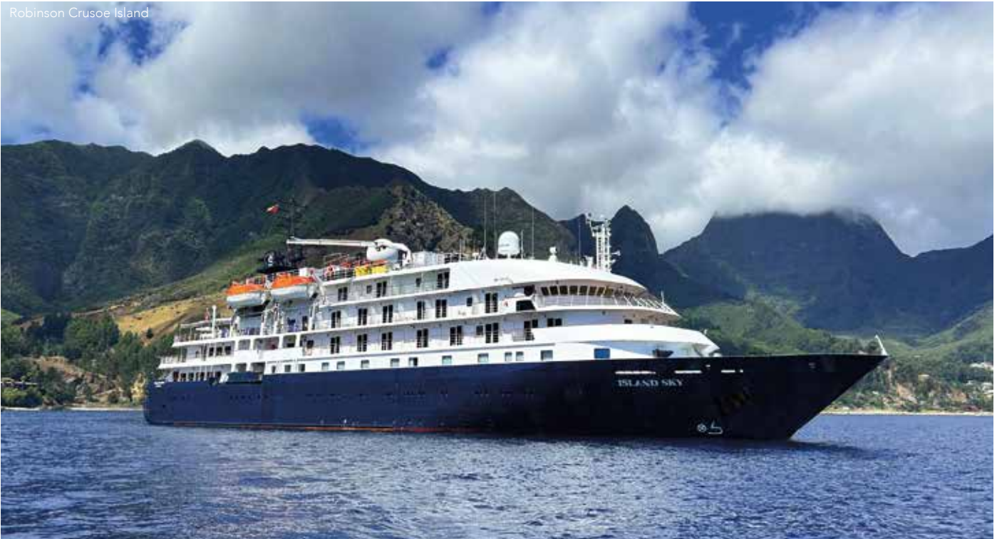
Robinson Crusoe Island