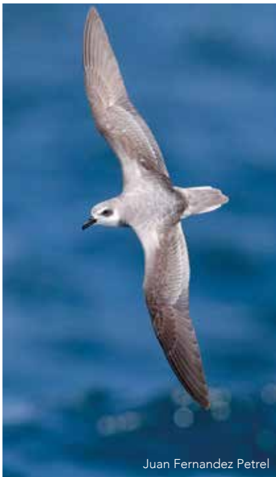
Juan Fernandez Petrel