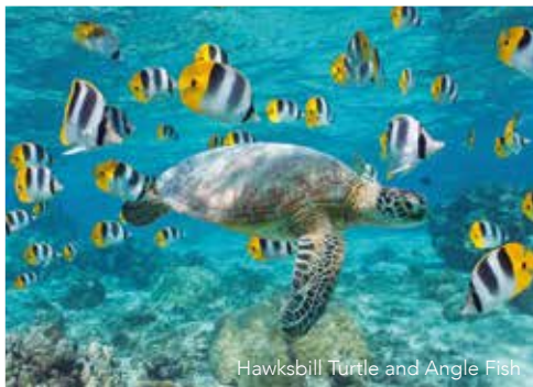
Hawksbill Turtle and Angelfish

Day 20 Mangareva, Gambier Islands. Mountainous Mangareva is the capital of the Gambier group of islands and home to the remarkable St Michael's Cathedral and its stunning mother-of-pearl altar. We will spend the full day on the island and there will be the opportunity to join an island nature walk, take a hike up Mount Duff, named after the first European vessel to visit the island in 1797, or spend time simply wandering around the small village. If weather permits, a snorkelling platform will be set up on the surrounding coral reef.