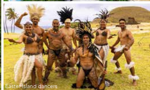
Easter Island dancers