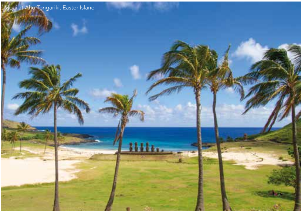
Moai at Ahu Tongariki, Easter Island.