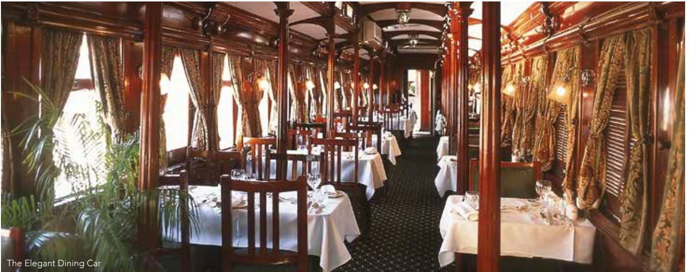
The Elegant Dining Car