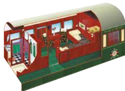
Deluxe Suite showing twin beds (configuration either L-shaped twin or double twin). Please note there are a limited amount of L-shaped cabins.