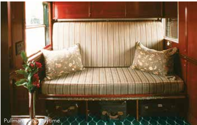
Pullman Suite, Daytime

With discreet and friendly service, top cuisine and a selection of South Africa's finest wines, Rovos Rail harks back to a simpler, more elegant era encompassing the timeless grace and high romance of African exploration. The beautifully rebuilt train, which may be hauled by diesel or electric locomotives, carries a maximum of 72 passengers in 36 superbly appointed suites.