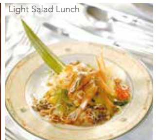
Light Salad Lunch