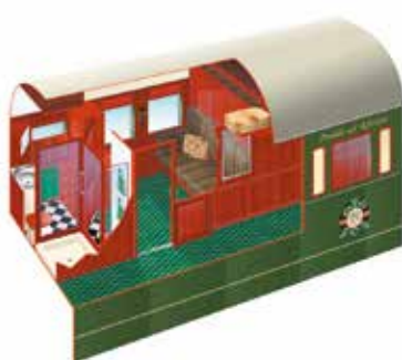
Pullman Suite showing daytime configuration.