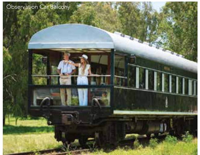
Observation Car Balcony

In maintaining the spirit of travel of a bygone era, there are no radios or television sets on board. The use of mobile phones, laptops and essentially anything that has the ability to disturb other passengers is confined to the privacy of your suites only. For days on the train dress is smart casual. Evening attire is more formal – for the gentlemen a jacket and tie is a minimum requirement while for ladies cocktail/evening dresses or suits.