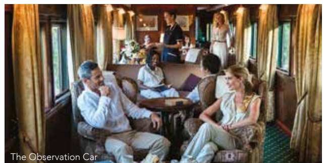
The Observation Car