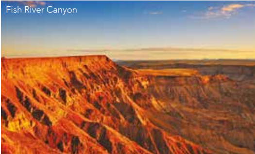
Fish River Canyon