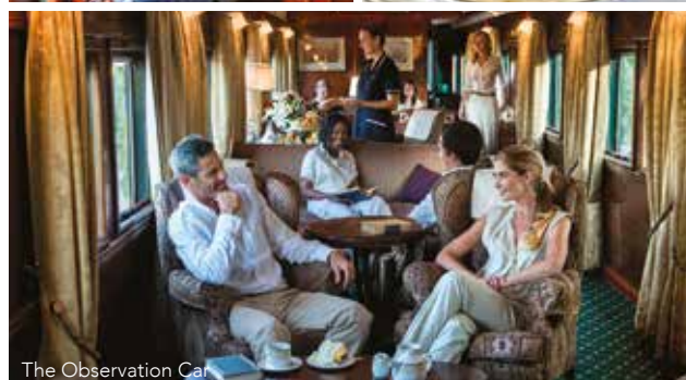
The Observation Car