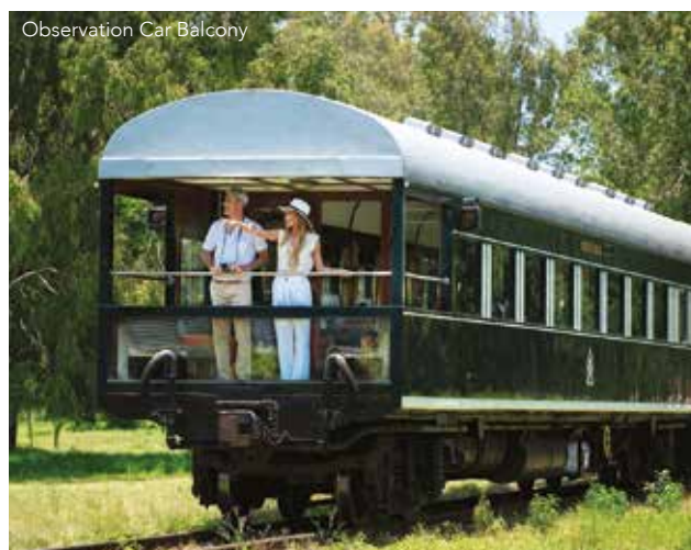
Observation Car Balcony

In maintaining the spirit of travel of a bygone era, there are no radios or television sets on board. The use of mobile phones, laptops and essentially anything that has the ability to disturb other passengers is confined to the privacy of your suites only. For days on the train the dress code is casual. During the day, comfortable and casual attire is appropriate, and the evenings are smart casual.