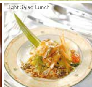
Light Salad Lunch