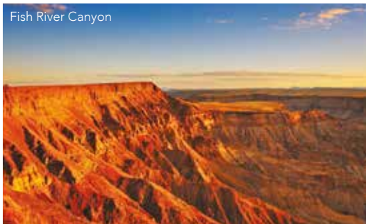
Fish River Canyon