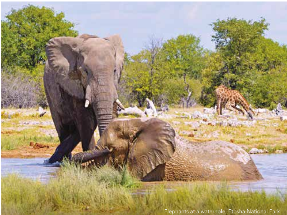
Elephants at a waterhole, Etosha National Park