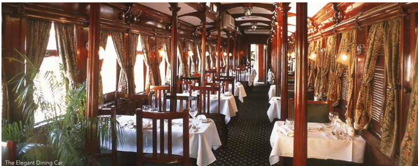
The Elegant Dining Car