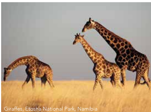
Giraffes, Etosha National Park, Namibia