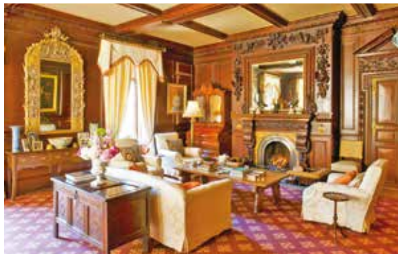
Somerleyton Hall interior