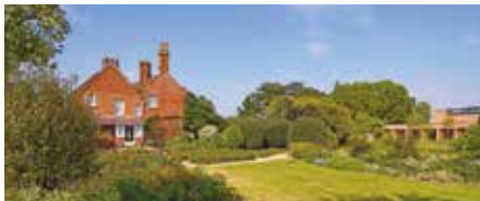
The Red House at Aldeburgh

Day 3 Beth Chatto Garden & Dedham. Depart in the morning for the Beth Chatto Gardens, across the border in North Essex. Beth Chatto, OBE took an overgrown wasteland of brambles, parched gravel and boggy ditches in 1960 and created one of the most amazing gardens in the country. Beth oversaw the development of the gardens well into her 90's and they remain a family-run business. Wonder at the Gravel Garden which was once a car park and is never watered, as well as the Scree Garden, Water Garden and Woodland. In the late morning drive into Constable County to the delightful village of Dedham for lunch at the historic Sun Inn located in the picturesque High Street. Enjoy some free time for a stroll through Dedham and then either return to Aldeburgh or