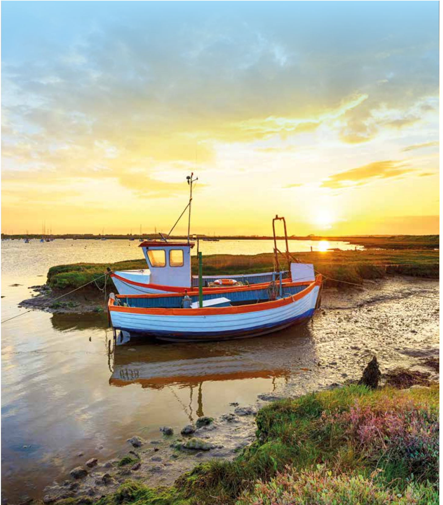
Sunset over fishing boats, River Alde, Aldeburgh.