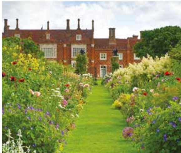
Helmingham Hall and Gardens