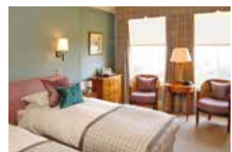
Larger King Size/Twin Room