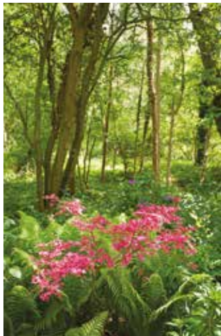
Beth Chatto Woodland Garden