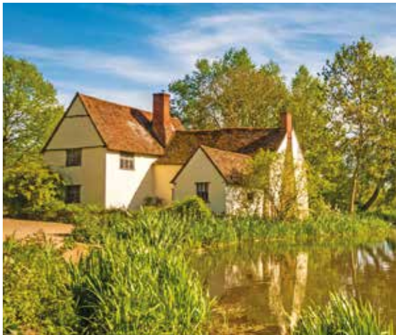
Flatford Mill, Dedham