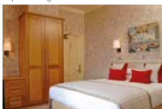
Standard Double Room