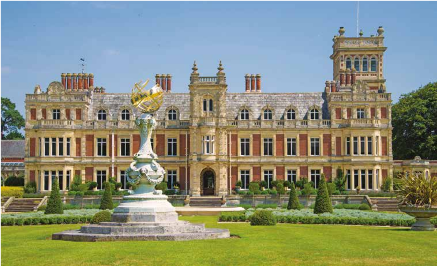
Somerleyton Hall and Gardens