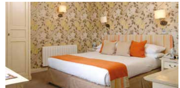
Superior King Size/Twin Room

Located on the ground or first floor, these rooms have a five-foot double bed or six-foot king size bed (which can be split into two three-foot single beds) and are inland facing with en-suite shower room or bathroom.