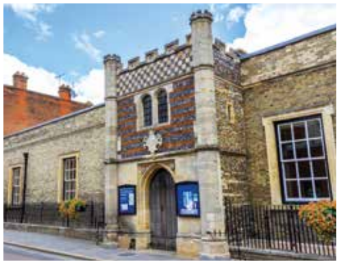
The Guildhall, Bury St Edmunds