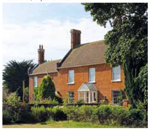
The Red House