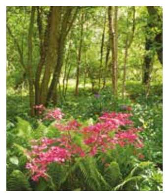
Beth Chatto Woodland Garden