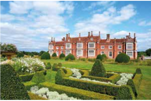
Helmingham Hall and Gardens