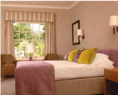
Darfield House Double/King Size/Twin Room