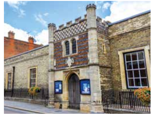
The Guildhall, Bury St Edmunds