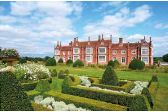
Helmingham Hall and Gardens