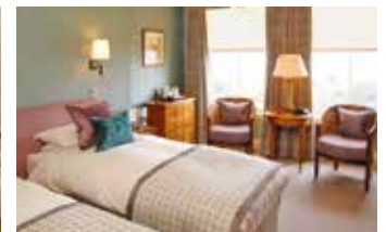
Larger King Size/Twin Room