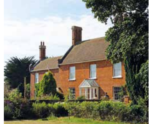
The Red House