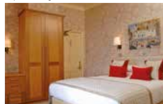
Standard Double Room