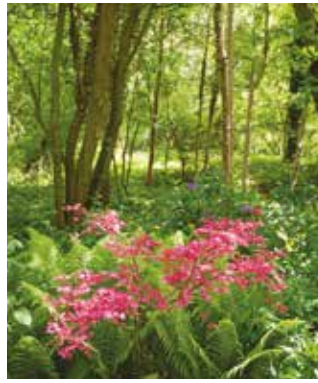
Beth Chatto Woodland Garden