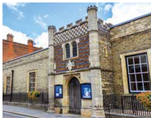
The Guildhall, Bury St Edmunds