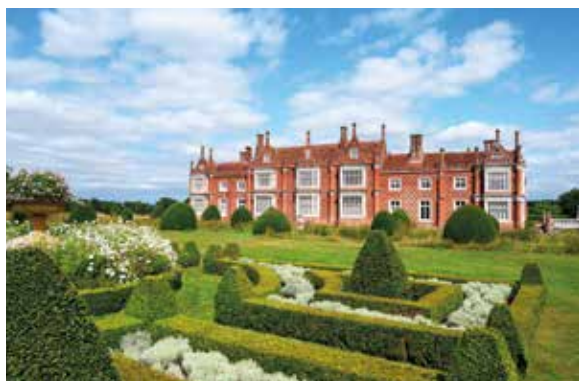
Helmingham Hall and Gardens