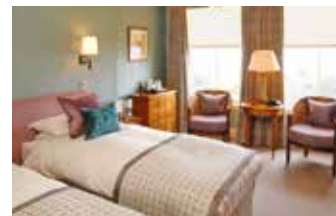
Larger King Size/Twin Room