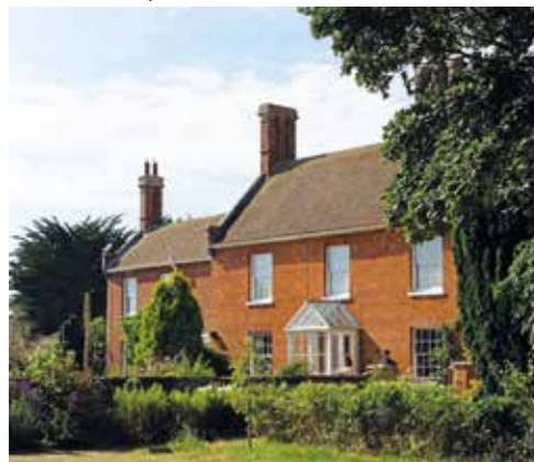
The Red House