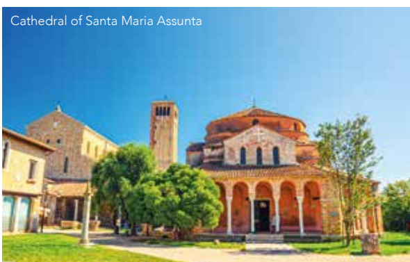
Cathedral of Santa Maria Assunta

I hope you will return from this trip with a deeper understanding of the complexity of Venice's millenary history and its contemporary fragility, but most importantly with a profound love and connection with the Venetian Lagoon.