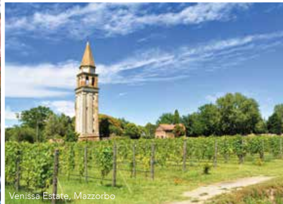
Venissa Estate, Mazzorbo