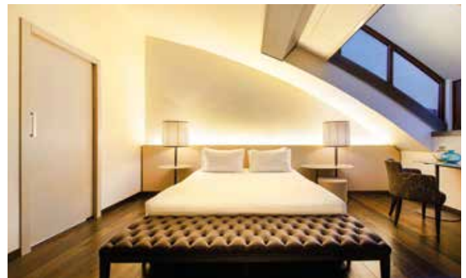
Deluxe Premium room