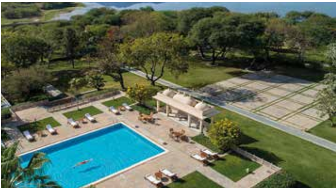
View from hotel

Nestled in the heart of vibrant and bustling Mumbai lies the five-star Trident, Nariman Point. Soaring 35 storeys high, it offers panoramic views of Marine Drive and is one of Mumbai's finest hotels. The 586 rooms and suites offer stunning views of the ocean and the Mumbai city skyline and are decorated in serene colours with contemporary furnishings. Spacious and well-appointed with all modern amenities including complimentary Wi-Fi, marble bathrooms and white linen, the rooms are complemented by attentive yet unobtrusive service. There is a lovely pool, raised above the seafront with views out to sea, an excellent spa with a range of Ayurvedic and Western treatments and a large fitness centre. The highlight of your stay, though, will most certainly be an early morning or late evening walk down the promenade to take in the sea breeze and feel the pulse of Mumbai.