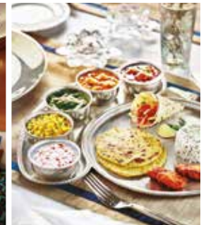
Food on board