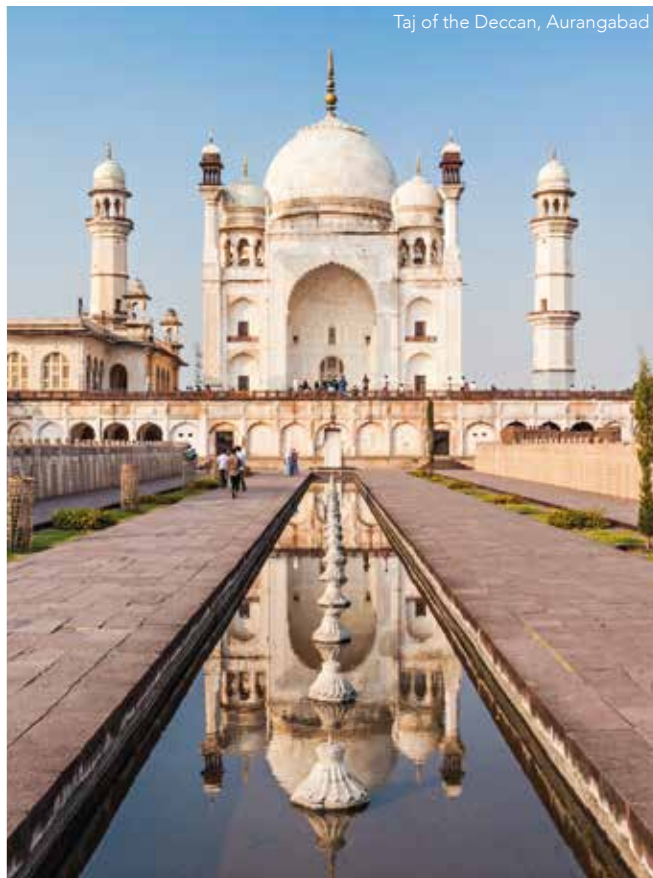
Taj of the Deccan, Aurangabad

white-eyed buzzards, storks, waterfow s, four endangered vulture species, and the green pigeon, which is the state bird of Maharashtra. After a thrilling day at Pench, drive back to Ramtek station to board the Deccan Odyssey. (B, L, D)