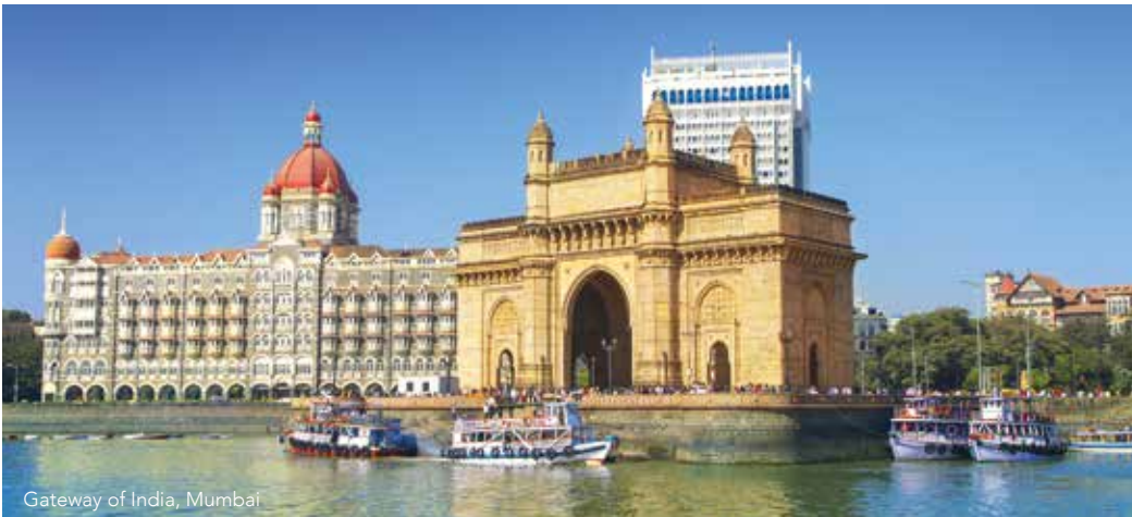
Gateway of India, Mumbai