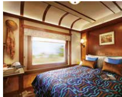
Deluxe Double Cabin