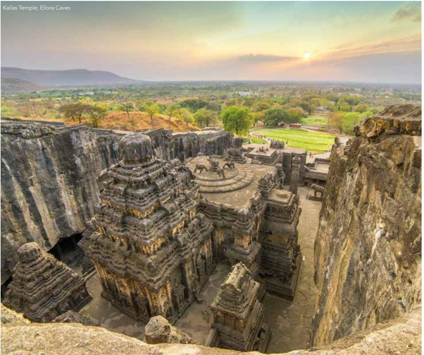
Kailas Temple, Ellora Caves

Diverse seems such an inadequate word when describing India. The full spectrum of climates, cultures and wildlife are all there in their glory and probably the biggest mistake any visitor can make is to attempt to see too much all in one trip. This itinerary has therefore been designed to focus in the main on the western seaboard of India as we believe that exploring an area in depth and travelling with a small like-minded group provides the most rewarding experience.