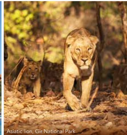
Asiatic lion, Gir National Park