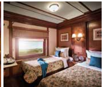
Deluxe Twin Cabin