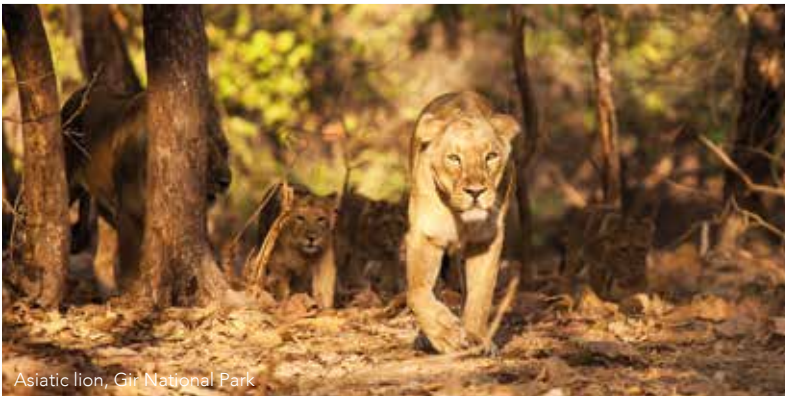
Asiatic lion, Gir National Park