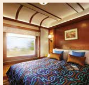
Deluxe Double Cabin