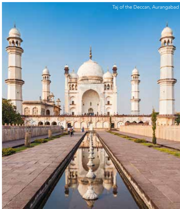
Taj of the Deccan, Aurangabad

Day 12 Tadoba Tiger Reserve. Today, the Deccan Odyssey will arrive at Chandrapur station, for your early morning safari into the Tadoba Tiger Reserve. Also called the Land of Tigers, this reserve is known for its high tiger density. It is not unusual to spot tigers and wild dogs here. You also have plenty of opportunities for close encounters with leopards, sloth bears, gaurs (the Indian bison), the rusty spotted cat, ratels, various species of deer and more. After an exhilarating morning, enjoy a late breakfast at the Tiger Trails Lodge. Follow this with a documentary on wildlife or interact with the naturalist. After lunch at the lodge we drive back to Chandrapur station to board the Deccan Odyssey. (B, L, D)