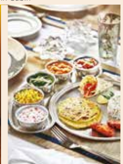
Food on board