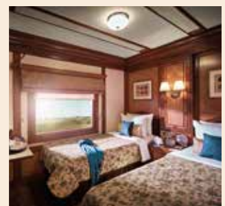
Deluxe Twin Cabin