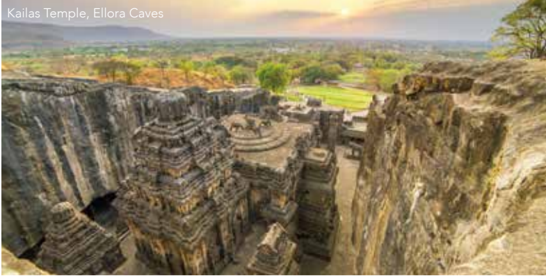
Kailasa Temple, Ellora Caves