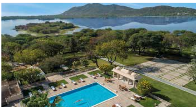
View from hotel

Nestled in the heart of vibrant and bustling Mumbai lies the five-star Trident, Nariman Point. Soaring 35 storeys high, it offers panoramic views of Marine Drive and is one of Mumbai's finest hotels. The 586 rooms and suites offer stunning views of the ocean and the Mumbai city skyline and are decorated in serene colours with contemporary furnishings. Spacious and well-appointed with all modern amenities including complimentary Wi-Fi, marble bathrooms and white linen, the rooms are complemented by attentive yet unobtrusive service. There is a lovely pool, raised above the seafront with views out to sea, an excellent spa with a range of Ayurvedic and Western treatments and a large fitness centre. The highlight of your stay, though, will most certainly be an early morning or late evening walk down the promenade to take in the sea breeze and feel the pulse of Mumbai.