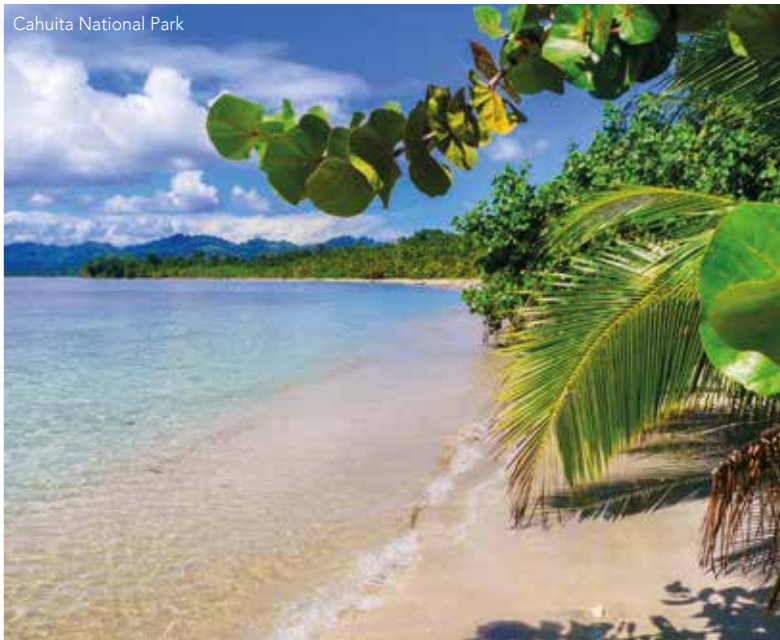
Cahuita National Park