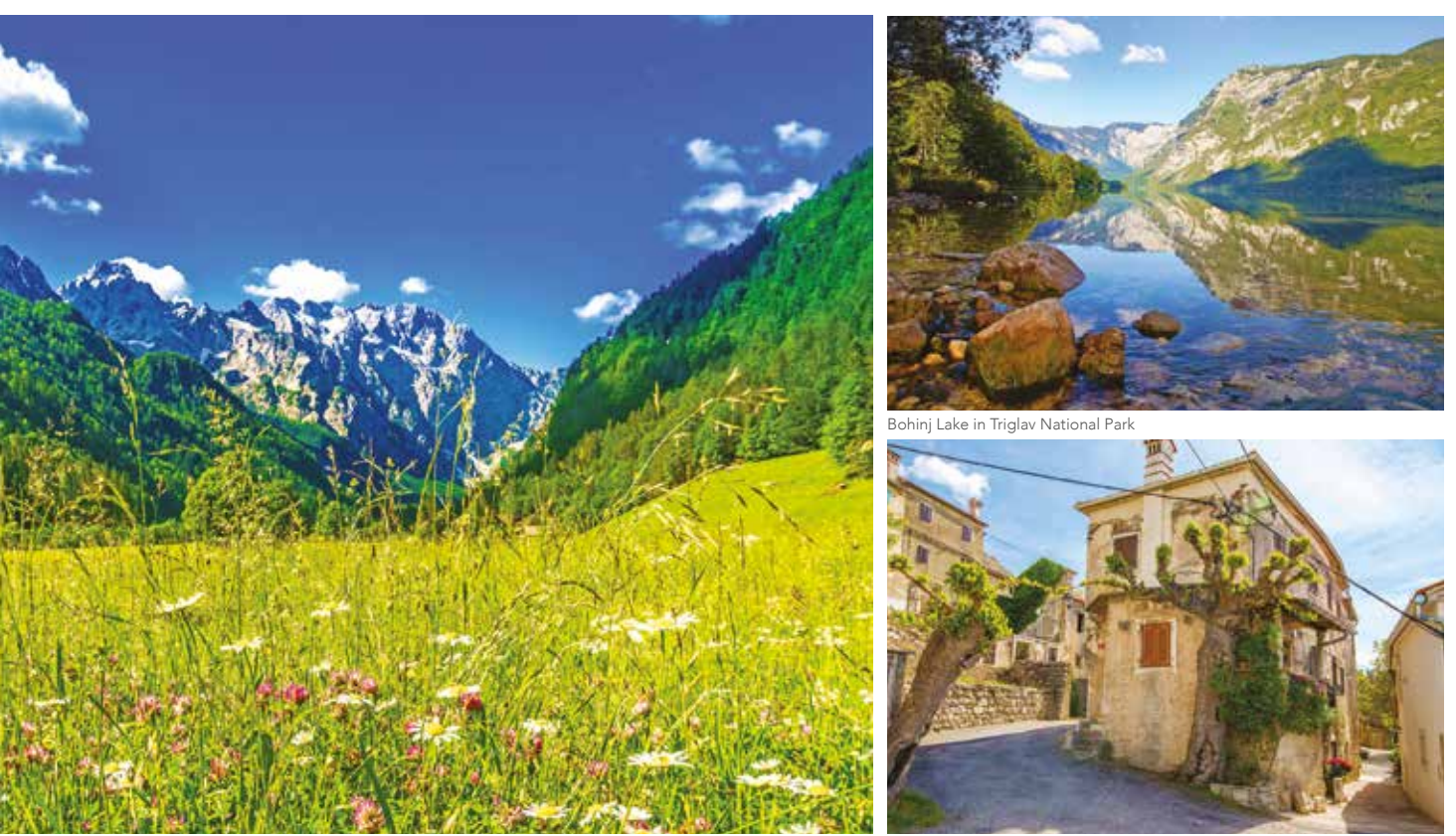
Wild flowers in the Logarska Valley meadows