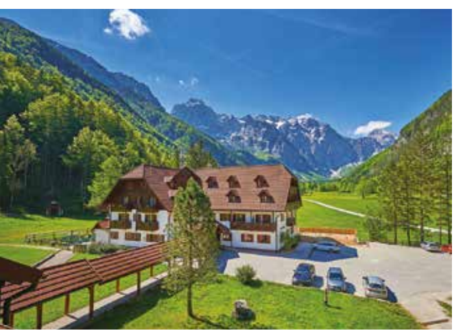
Hotel Plesnik and the Kamnik Savinja Alps