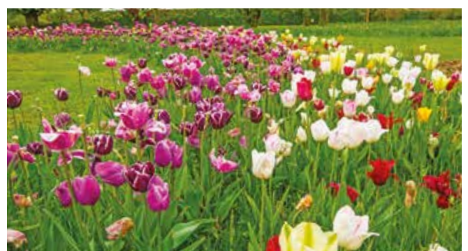
Colourful tulips, Volcji Potok Arboretum

During the course of our eight day escorted tour, we will stay in some charming properties, one with magnificent views over Lake Bled, one in the heart of Ljubljana city and the other idyllically set in the Logar Valley, one of the most beautiful Alpine glacial valleys in Europe. The itinerary will be well paced so that, when not enjoying the guided tours or exploring independently, there will be time to relax and appreciate these wonderful settings, partaking in a gentler style of tourism that suits Slovenia so well.