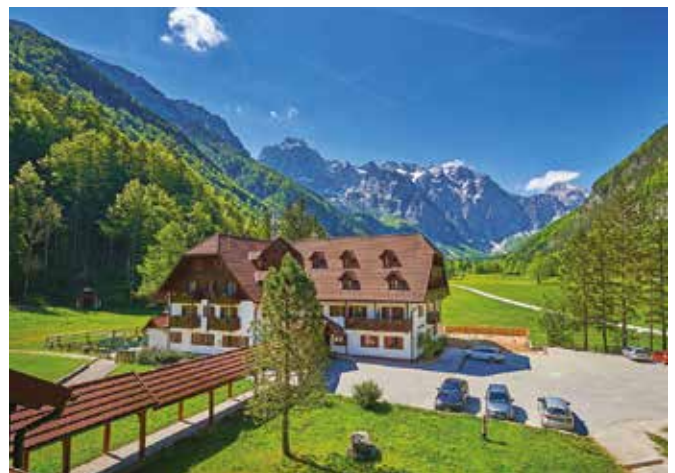
Hotel Plesnik and the Kamnik Savinja Alps