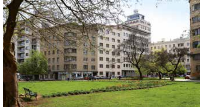
Urban Boutique Hotel exterior