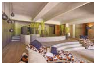
Whirlpool and Wellness Centre