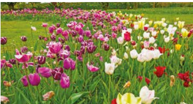
Colourful tulips, Volcji Potok Arboretum

During the course of our eight day escorted tour, we will stay in some charming properties, one with magnificent views over Lake Bled, one in the heart of Ljubljana city and the other idyllically set in the Logar Valley, one of the most beautiful Alpine glacial valleys in Europe. The itinerary will be well paced so that, when not enjoying the guided tours or exploring independently, there will be time to relax and appreciate these wonderful settings, partaking in a gentler style of tourism that suits Slovenia so well.