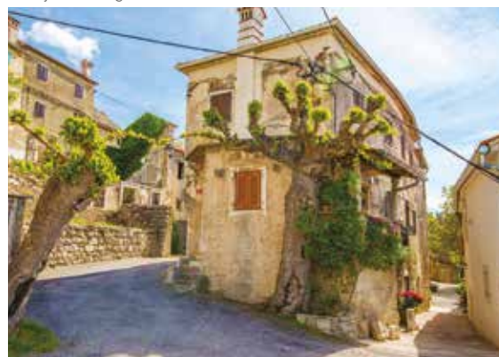
Traditional old Karst stone house, Stanjel

Once back ashore, transfer to nearby Radovljica and its beautiful Linhart Square to learn about the traditional Slovenian craft of lectar, a sweet honey-bread that is decorated by hand. Enjoy a local lunch here before returning to Bled for an afternoon and evening at leisure. (B, L)