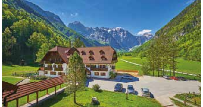
Hotel Plesnik and the Kamnik Savinja Alps