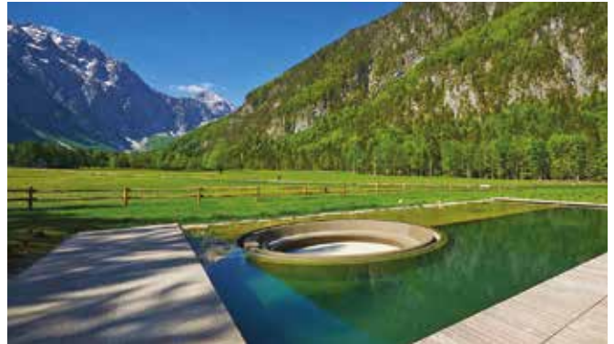
Outdoor Pool and the Meadows