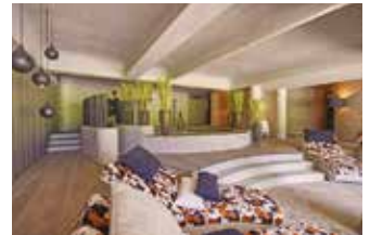
Whirlpool and Wellness Centre