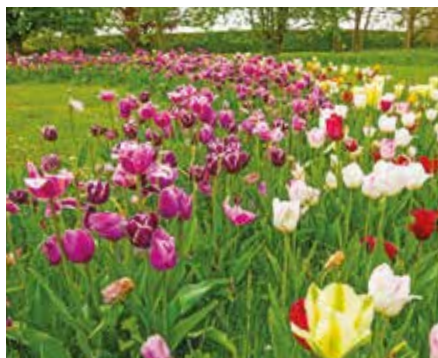
Colourful tulips, Volcji Potok Arboretum

Day 5 Volcji Potok & Ljubljana. Check out of the hotel this morning and following a short drive, explore Slovenia's largest botanical park, the Volcji Potok Arboretum. Founded in 1952 by the University of Ljubljana, the 80 hectare site contains a diverse mix of plant collections