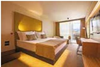
Double Room with Lake View