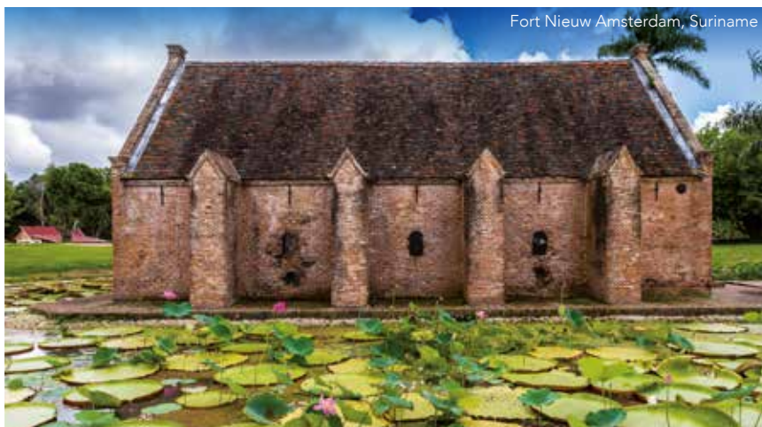
Fort Nieuw Amsterdam, Suriname