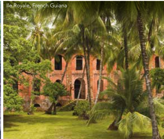
Ile Royale, French Guiana