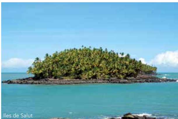
Iles de Salut