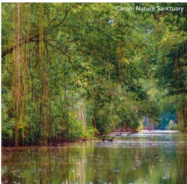
Caroni Nature Sanctuary