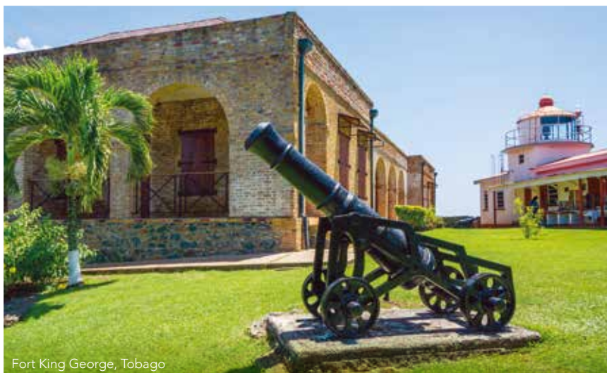
Fort King George, Tobago

St Georges Cathedral, St Andrew's Kirk and the Stabroek Market. Once described as a 'bizarre bazaar', the market offers every conceivable item from household goods and gold jewellery to fresh meat and vegetables brought to town on the river daily. We will also fly to the Kaieteur National Park where the mighty Kaieteur Falls plunge 822 feet to the bottom of a rocky gorge. Five times the height of Niagara Falls, an amazing 30,000 gallons of water per second crashes to the depths below and witnessing this spectacle is an amazing experience. There will also be the opportunity to tour the extensive botanical gardens where we may see many of the resident birds including the blood-coloured woodpecker, pearl kite and red-bellied macaws.