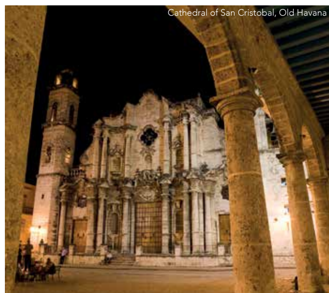
Cathedral of San Cristobal, Old Havana

Day 10 Livingston, Guatemala. Surrounded by water and jungle, Livingston is a settlement of Garifuna people accessible only by sea which is just one of the