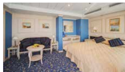
EXECUTIVE SUITE (approx. 25 square metres)