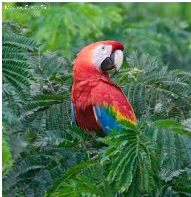
Macaw, Costa Rica

Day 5 Bocas del Toro. Today we explore the Bocas del Toro archipelago, pristine islands which are now part of a national marine park. We spend the morning surrounded by astounding beauty and using local boats will explore the mangroves where we hope to see sloths, dolphins in the water and find a remote beach to swim and snorkel on the coral reefs. This afternoon we will visit the small town of Bocas del Toro and have free time to wander amongst the fine old Spanish buildings.