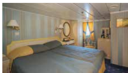
DELUXE STATEROOM (approx. 15 to 25 square metres)