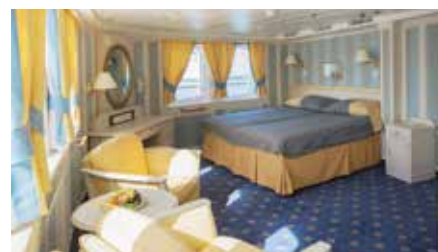
OWNER'S SUITE (approx. 22 square metres)