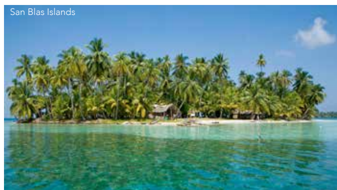
San Blas Islands

A flexible itinerary and knowledgeable onboard team will enable us to make the most of each day, whether we are landing on remote beaches by Zodiac, watching out for wildlife or learning more of the history and culture of the places we are visiting. With just over 100 passengers, we can explore in small groups ashore and enjoy a convivial atmosphere onboard.