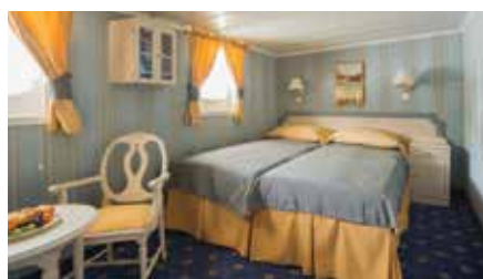
SUPERIOR STATEROOM (approx. 11.5 to 18 square metres)