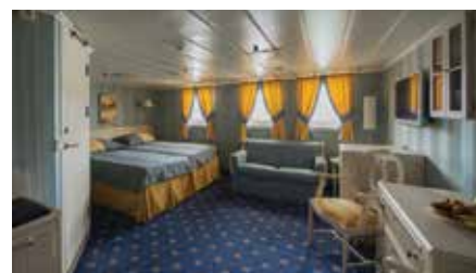
JUNIOR SUITE (approx. 21 square metres)