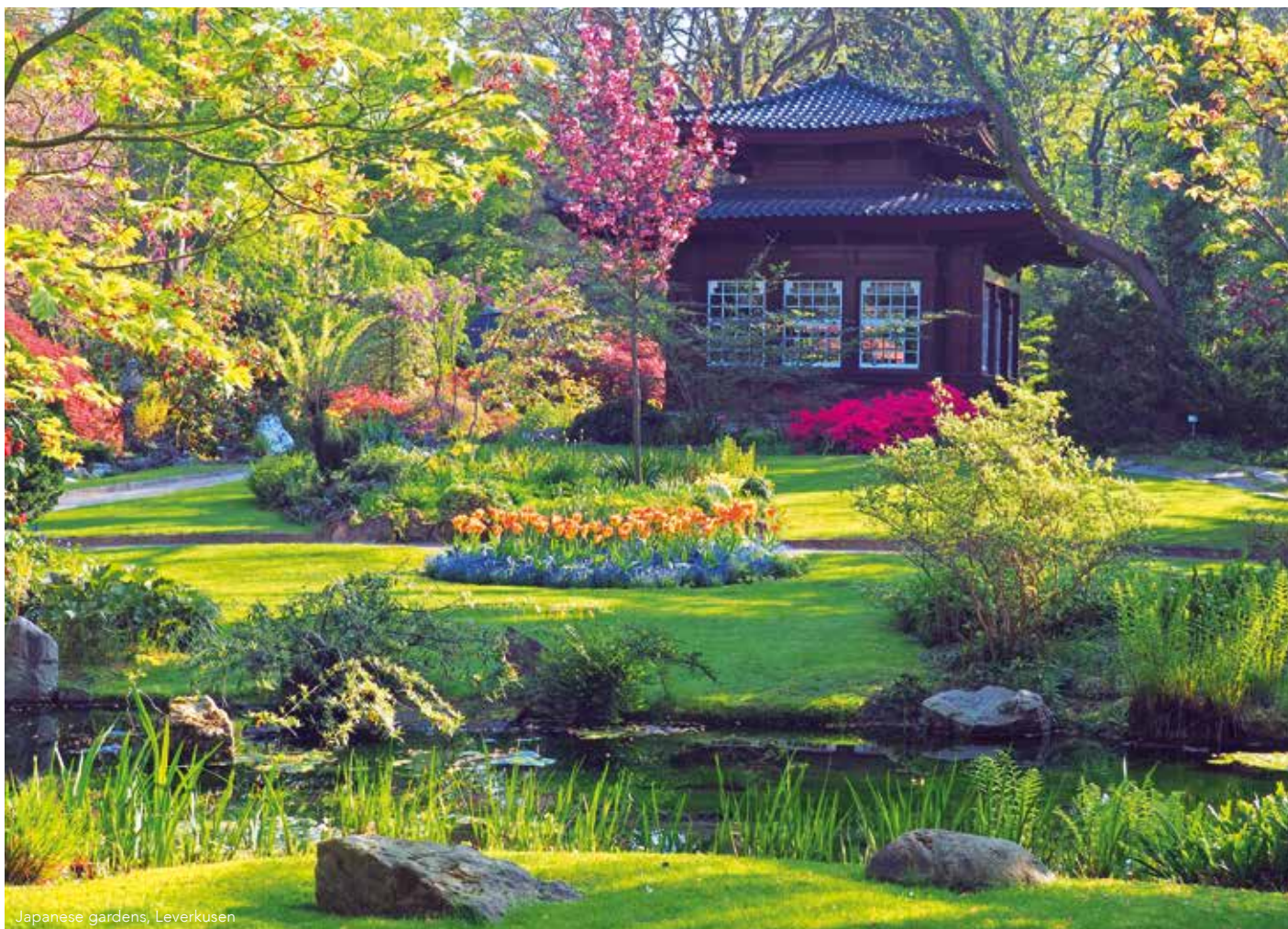
Japanese gardens, Leverkusen

The long summer days of July are perfect for exploring the beauty of Germany and the Netherlands' spectacular gardens which will be in full bloom. Join us aboard the elegant 100-passenger MS River Crown as we journey along the Rhine visiting the region's most enchanting horticultural wonders with a plethora of historical, cultural and scenic delights to be enjoyed along the way.