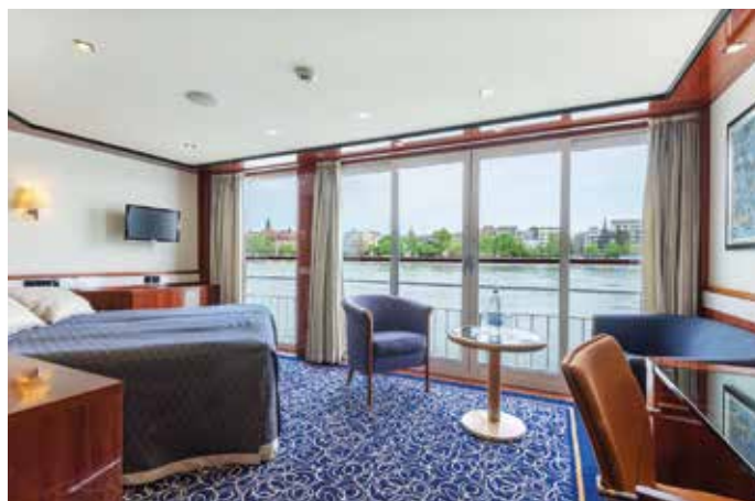
Deluxe Cabin with French Balcony