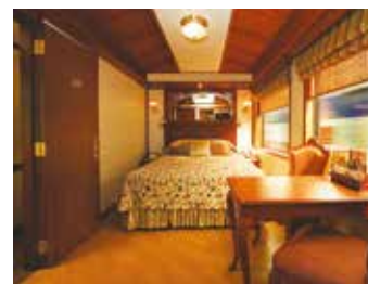
Junior Suite with double bed