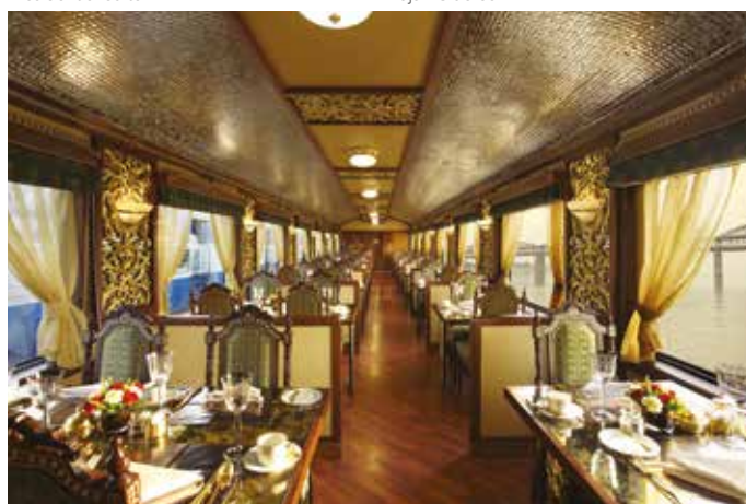
Mayur Mahal dining room