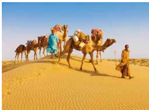
Camel train in the Thar Desert near Bikaner