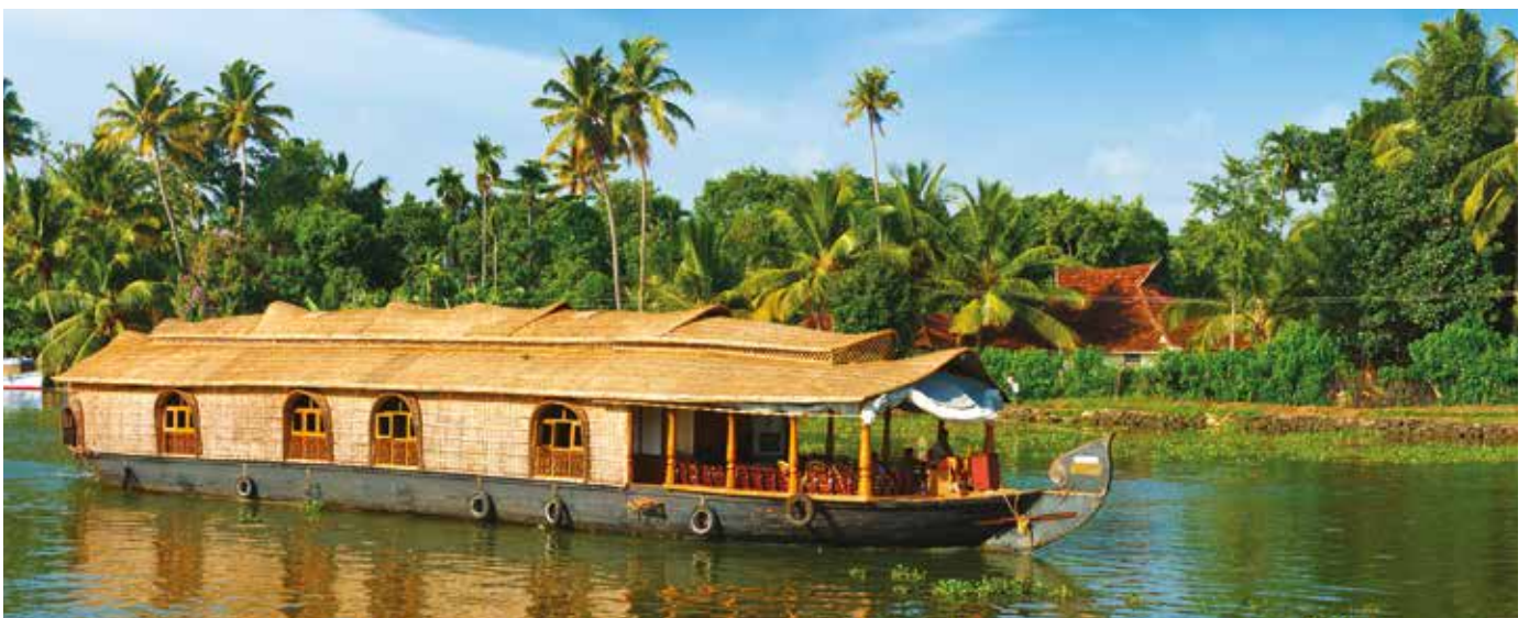
Houseboat on the backwaters of Alleppey

Not Included: Travel insurance, visas, gratuities.