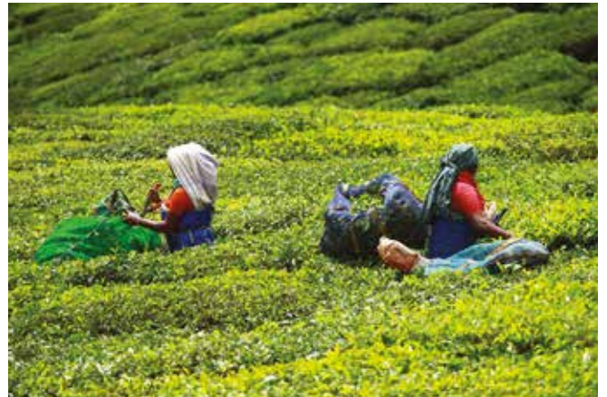
Tea plantation, Munnar