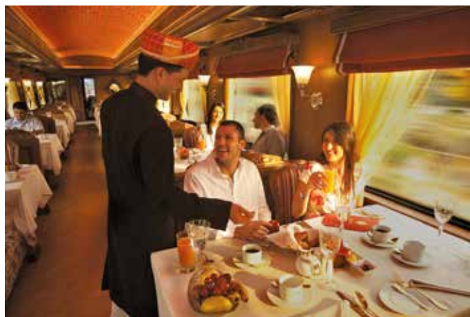
Breakfast in the Rang Mahal dining room

To enhance your experience, during our journey there are unforgettable one-of-a kind Gala experiences showcasing the princely destinations combined with culinary delicacies served at some exquisite palaces. On board there is a dedicated team of butlers to attend to your every need. Each carriage is manned by a single butler, on call 24-hours, trained to meet the needs of our guests and comply with utmost speed and efficiency. The butlers take pride in offering unique services to each guest ensuring a memorable stay on board.