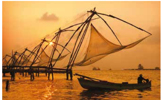
Chinese fishing nets at sunset, Fort Kochi

Day 19 Mararikulam to Kochi to Mumbai to London. Transfer to the airport for your scheduled flight to Mumbai and onward to London.