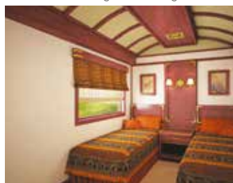
Deluxe cabin with twin beds