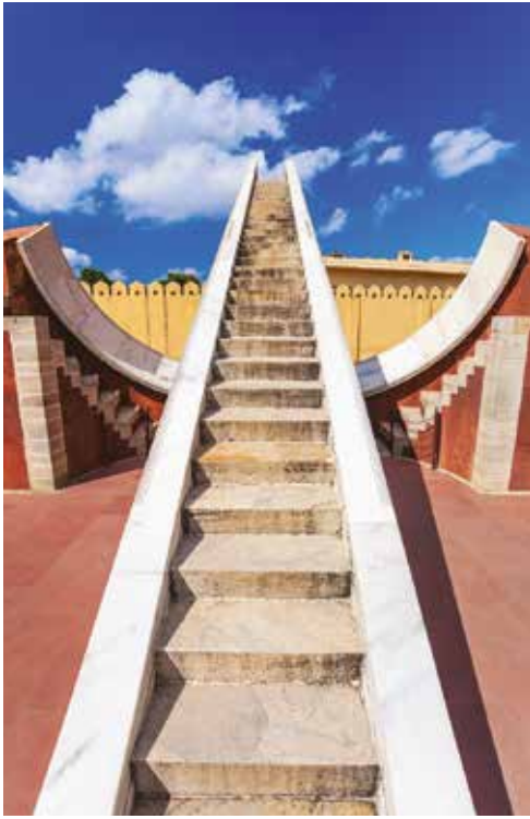
Jantar Mantar Observatory, Jaipur