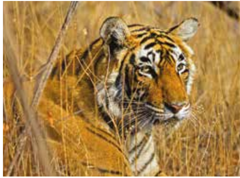
Royal Bengal Tiger, Ranthambore National Park