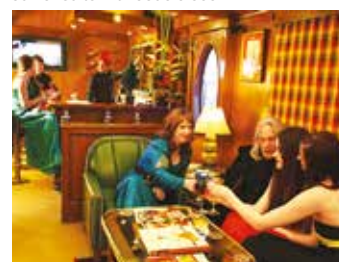
Rajah Club bar