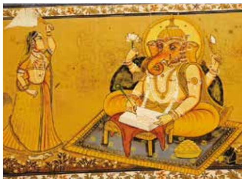
Wall painting at Mehrangarh Fort, Jodhpur