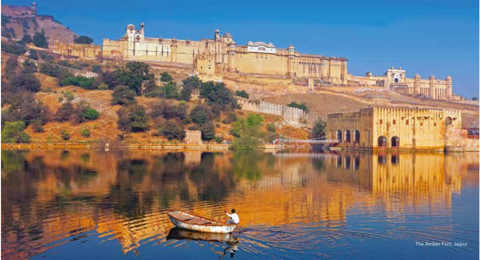
The Amber Fort, Jaipur