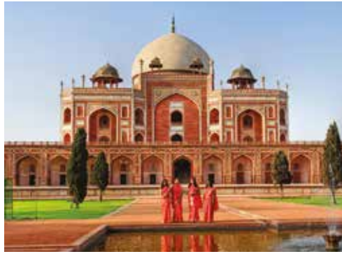
Mughal Emperor Humayun's tomb, New Delhi