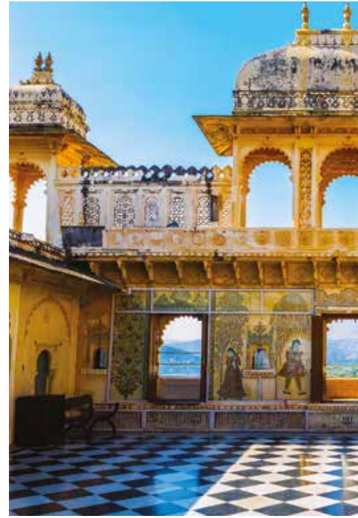
Courtyard of the City Palace, Udaipur