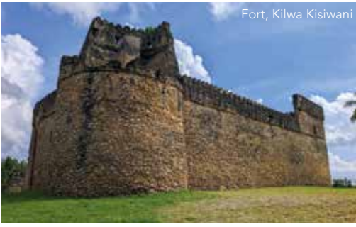
Fort, Kilwa Kisiwani