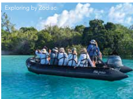
Exploring by Zodiac