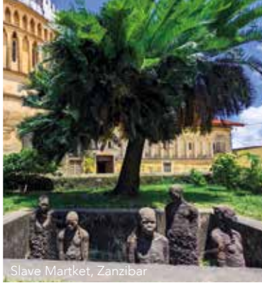
Slave Market, Zanzibar