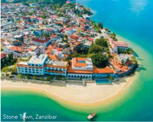
Stone Town, Zanzibar