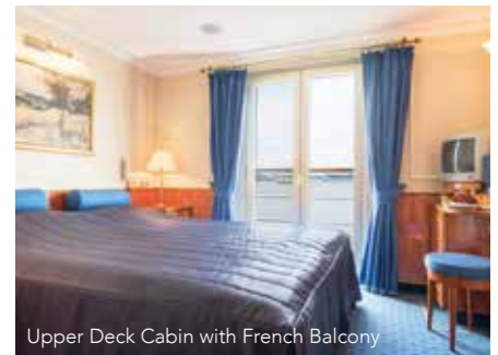
Upper Deck Cabin with French Balcony

Meals are taken in the Panorama Restaurant on the vessel's Main Deck which seats all passengers in an open seating arrangement and the excellent cuisine features delicious local and international dishes. Breakfast is buffet style with hot and cold items, and lunch and dinner are served as a set menu with a choice of three main courses including a vegetarian option. House wine, beer and soft drinks are included with lunch and dinner on board.