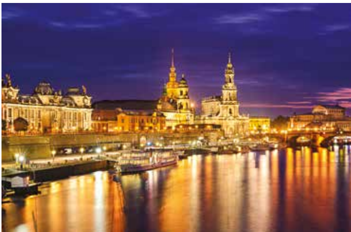
Dresden, 'Florence of the Elbe'

Day 8 Prague, Czech Republic. Our morning tour will focus on the Czech Republic's capital in all its elegance. Our guided walking tour of this UNESCO Heritage City will include the Charles Bridge, Old Town Square