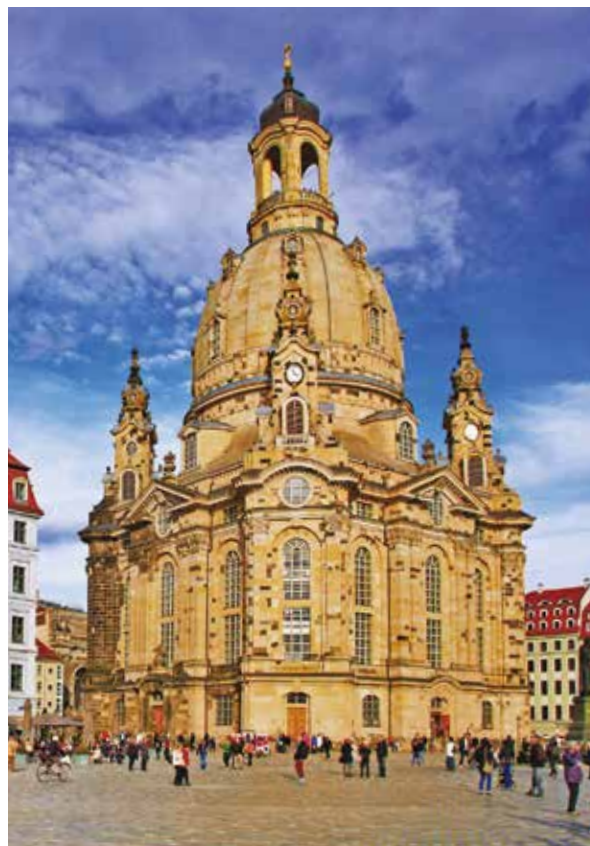
The Frauenkirche, Dresden

and the castle. After lunch on board the vessel, you are free to explore the Czech Republic's capital at your own pace.