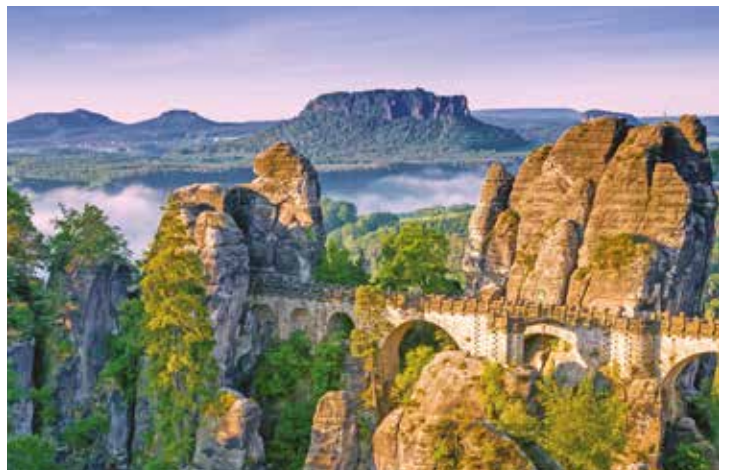
Bastei Bridge in Saxon Switzerland National Park