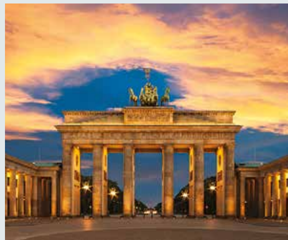
Berlin's imposing Brandenburg Gate

Not Included: Travel insurance, gratuities.