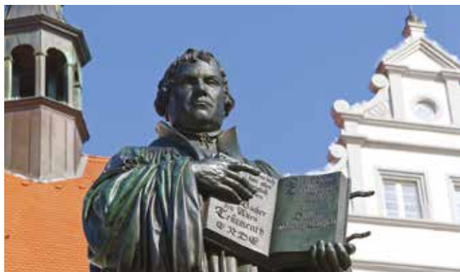
Martin Luther monument, Wittenberg

Day 9 Prague to London. Disembark after breakfast and transfer to the airport with lunch on route for our return scheduled flight to London.