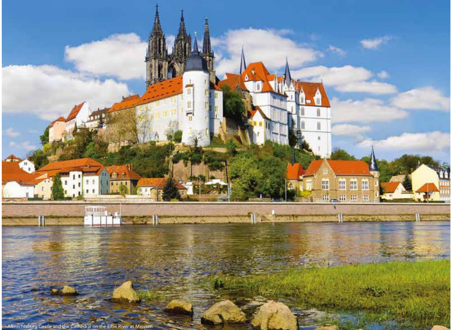
Albrechtsburg Castle and the Cathedral on the Elbe River at Meissen

Our journey will take us from the vibrant city of Berlin to Potsdam where we will visit the ‘Versailles of Prussia’ before we visit historic Magdeburg and Luther’s hometown of Wittenberg. We continue to the famous porcelain producing town of Meissen, to culturally rich Dresden and through the lovely Elbe Sandstone Mountains, where the Elbe has cut a deep valley through sandstone rocks. Our cruise then finishes in the graceful Czech capital of Prague. This is the perfect trip for those who enjoy seeing something different every day as our floating hotel, the MS Elbe Princesse transports you in considerable comfort between the two great cities of Berlin and Prague. The slow speed of the vessel allows you to absorb the changing landscape of town and country and observe everyday life along the river.