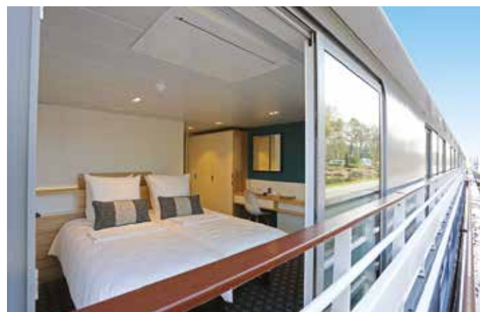
Upper Deck Cabin with French Balcony