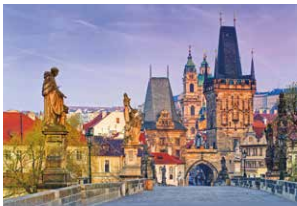
Charles Bridge, Prague