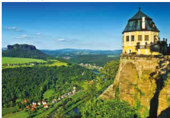
Castle Konigstein and the Elbe River