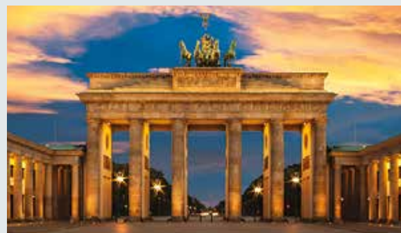
Berlin's imposing Brandenburg Gate

Not Included: Travel insurance, gratuities.