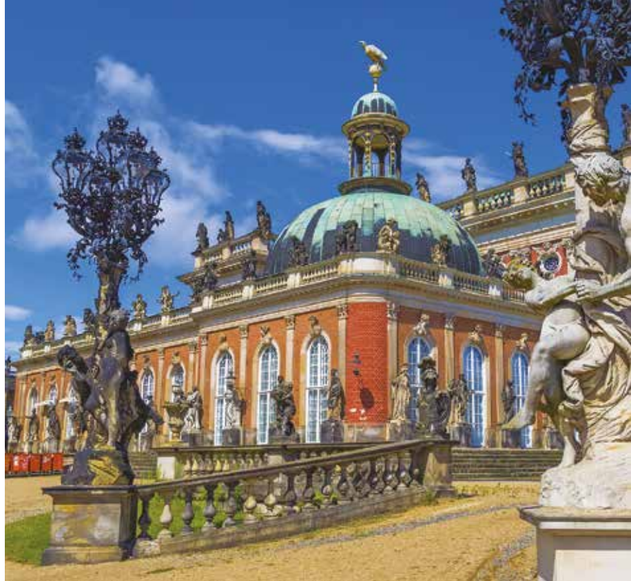
New Palace in Sanssouci Park, Potsdam