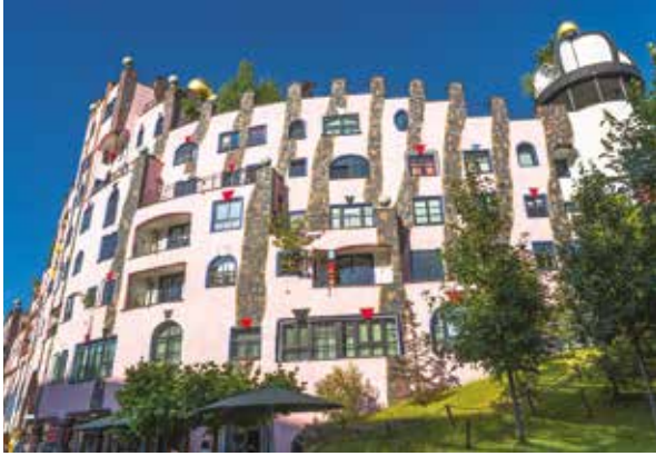
The Green Citadel, Magdeburg