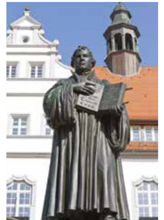
Martin Luther monument, Wittenberg

Day 5 Meissen. After a relaxing morning spent sailing we will arrive at the beautiful city of Meissen with its enchanting Renaissance houses. During our guided tour we will visit the Meissen factory museum where fine porcelain has been produced since the early 1700s and see first-hand how this trademarked porcelain is created by hand.