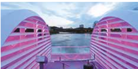
The rear paddle wheels

The vessel is comfortable with a convivial and informal atmosphere on board. The friendly crew will do their utmost to ensure your stay is enjoyable, informative and agreeable throughout. A daily briefing by the Cruise Director will give you information on the next day's activities and expert, English-speaking local guides provide insider knowledge into the local culture, architecture, history and traditions.