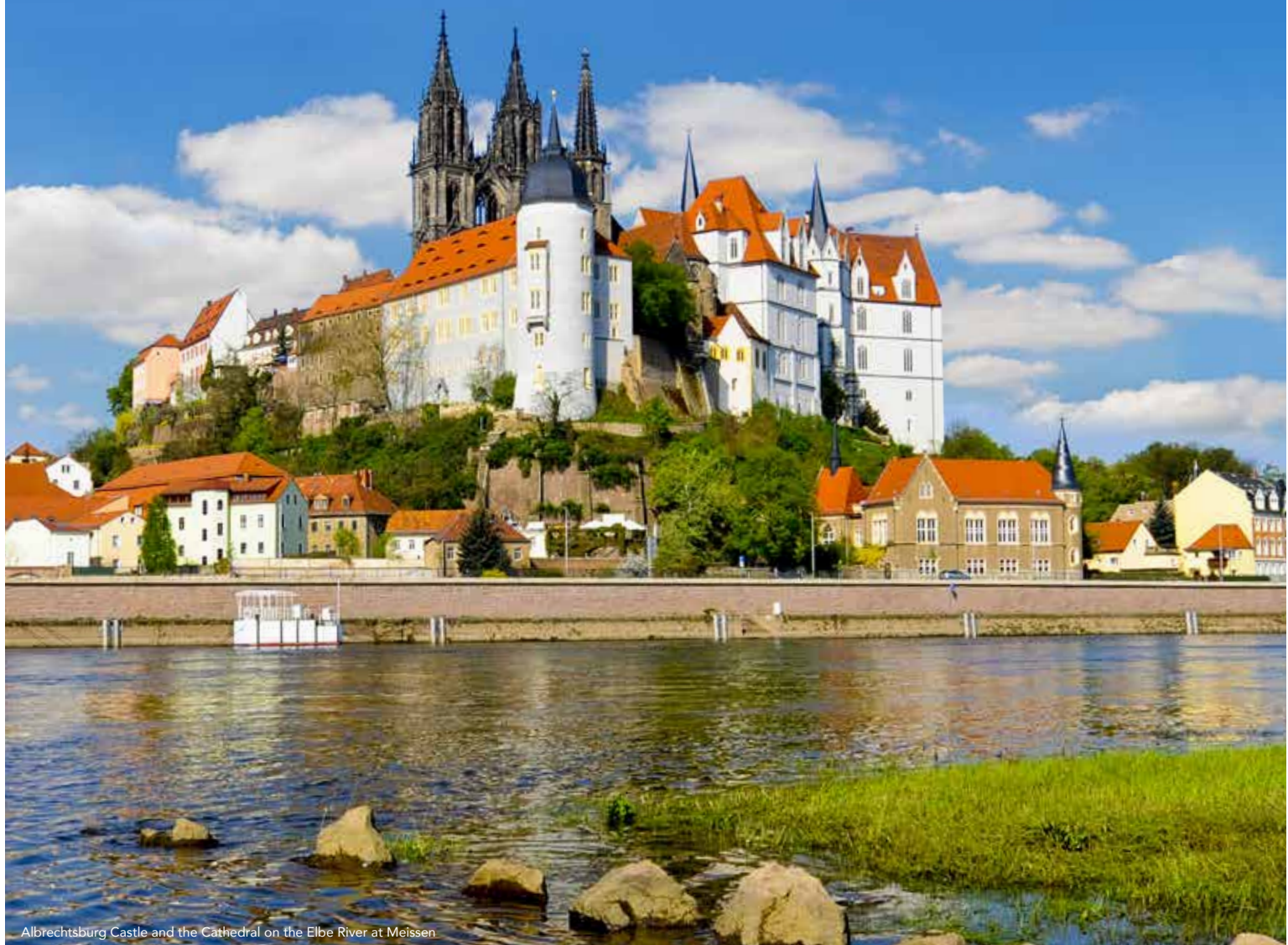
Albrechtsburg Castle and the Cathedral on the Elbe River at Meissen

Our journey will take us from the graceful Czech capital of Prague through the lovely Elbe Sandstone Mountains, where the Elbe has cut a deep valley through sandstone rocks, to culturally rich Dresden, the famous porcelain producing town of Meissen, Luther's hometown of Wittenberg and historic Magdeburg, ending in the vibrant city of Berlin. This is the perfect trip for those who enjoy seeing something different every day. Our floating hotel, the MS Elbe Princesse transports you in considerable comfort between the two great cities of Prague and Berlin. The slow speed of the vessel allows you to absorb the changing landscape of town and country and observe everyday life along the river.