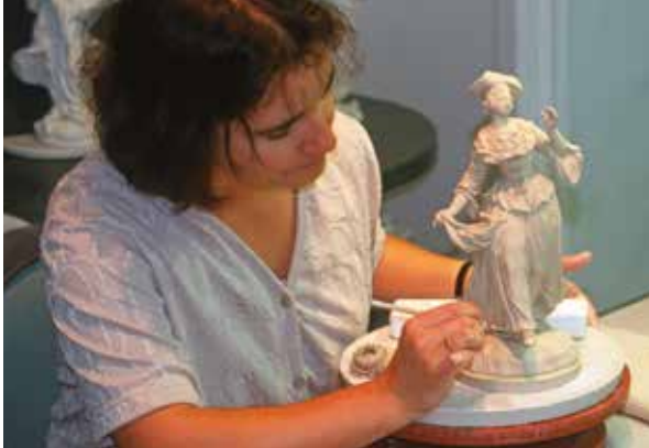
Meissen artist at work