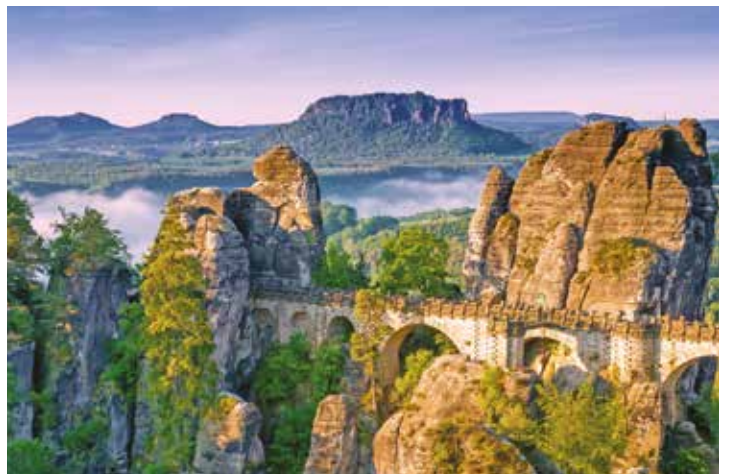
Bastei Bridge in Saxon Switzerland National Park