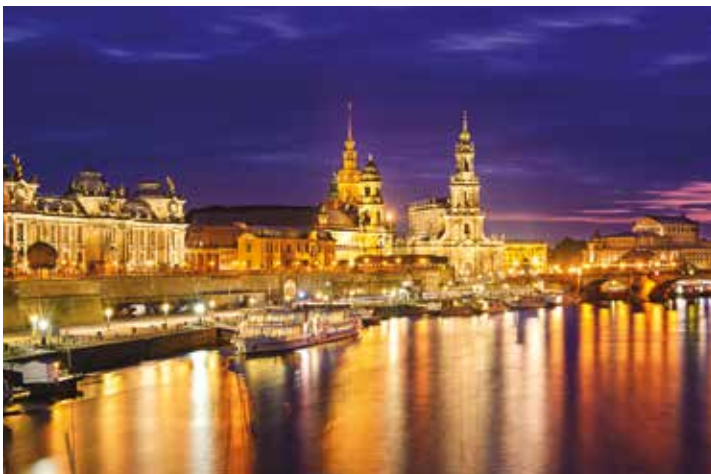
Dresden, 'Florence of the Elbe'

Day 6 Wittenberg. Wittenberg was the home of Martin Luther and the centre of the Protestant Reformation. It was here at the Schlosskirche in 1517 that