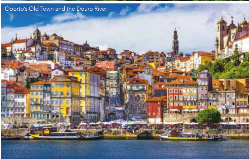
Oporto's Old Town and the Douro River