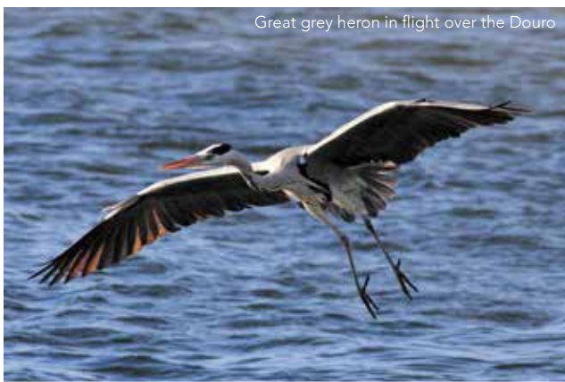
Great grey heron in flight over the Douro