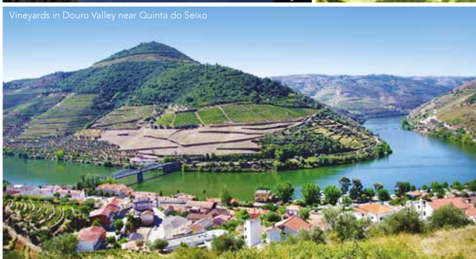
Vineyards in Douro Valley near Quinta do Seixo

On our guided tour of the Palace we will see the "rare books" library, as well as vestments and religious icons, and also view the remarkable chestnut wood crafting on the ceilings, as well as some beautiful paintings from the 17th and 18th centuries. Stroll around the romantic gardens which feature a unique 100 foot long cedar tunnel and formal garden. Finally, before returning to the vessel, there will be time to visit the villa's pretty chapel.