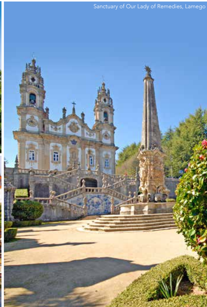
Sanctuary of Our Lady of Remedies, Lamego