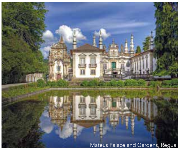
Mateus Palace and Gardens, Regua