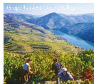
Grape harvest, Douro Valley

Day 2 Oporto to Entre-Os-Rios. This morning there will be a guided tour of Oporto, Portugal's second largest city and a World Heritage Site. This attractive city was originally a Celtic-Iberian settlement and became a prosperous Roman village thanks to its natural harbour. During our tour we will drive through its narrow streets to find 16th century arcaded buildings, Baroque churches and chapels, as well as the city's iconic 19th century iron bridge, built by the school of Gustav Eiffel. We continue along the coastal road of the Atlantic to