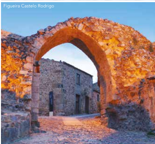
Figueira Castelo Rodrigo