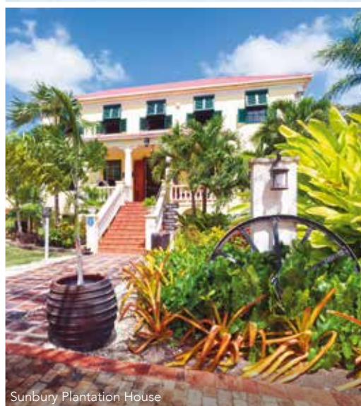
Sunbury Plantation House