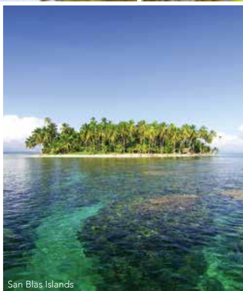
San Blas Islands