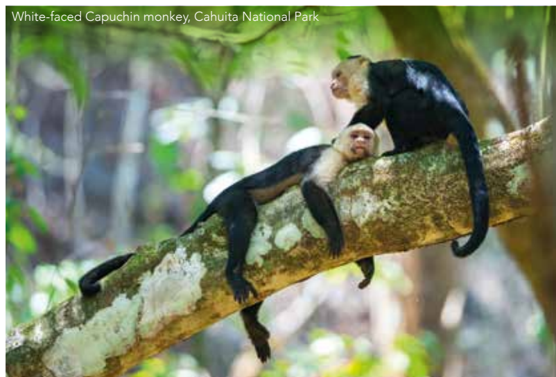
White-faced Capuchin monkey, Cahuita National Park