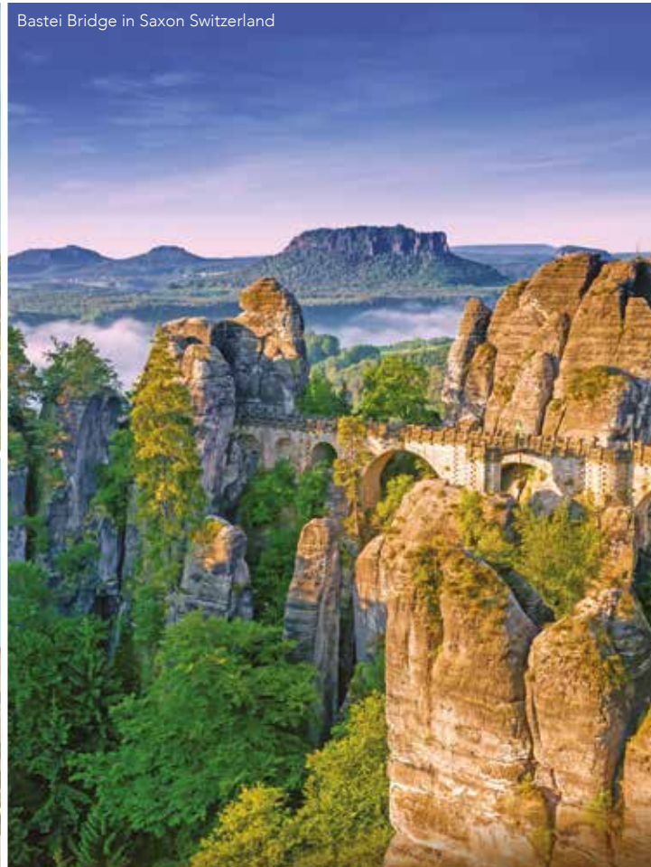
Bastei Bridge in Saxon Switzerland