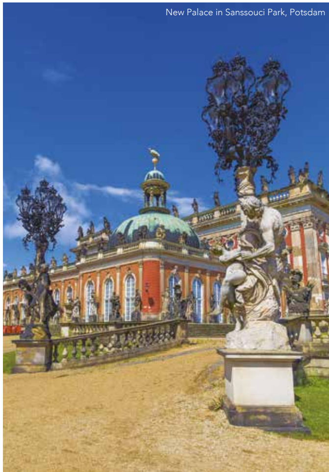
New Palace in Sanssouci Park, Potsdam