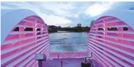
The rear paddle wheels

The vessel is comfortable with a convivial and informal atmosphere on board. The friendly crew will do their utmost to ensure your stay is enjoyable, informative and agreeable throughout. A daily briefing by the Cruise Director will give you information on the next day's activities and expert, English-speaking local guides provide insider knowledge into the local culture, architecture, history and traditions.