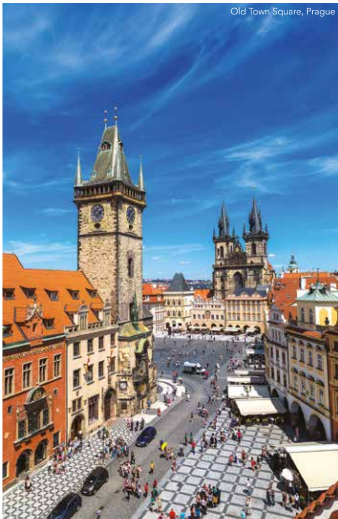
Old Town Square, Prague