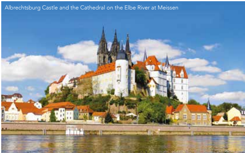
Albrechtsburg Castle and the Cathedral on the Elbe River at Meissen