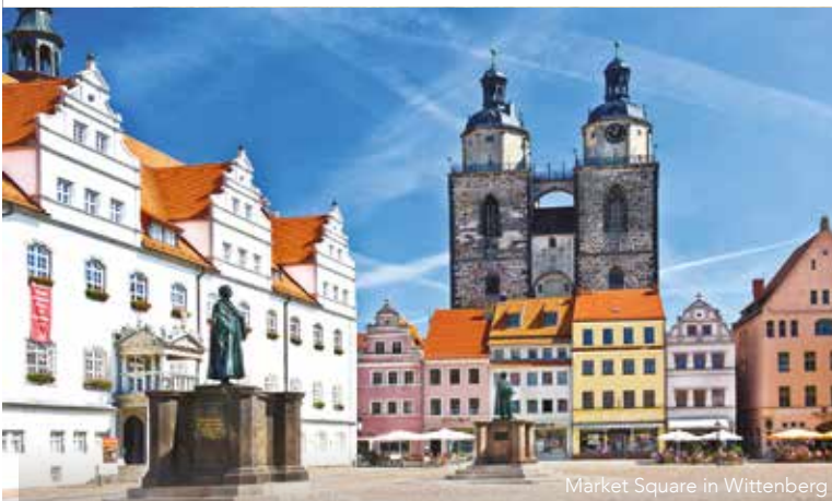
Market Square in Wittenberg