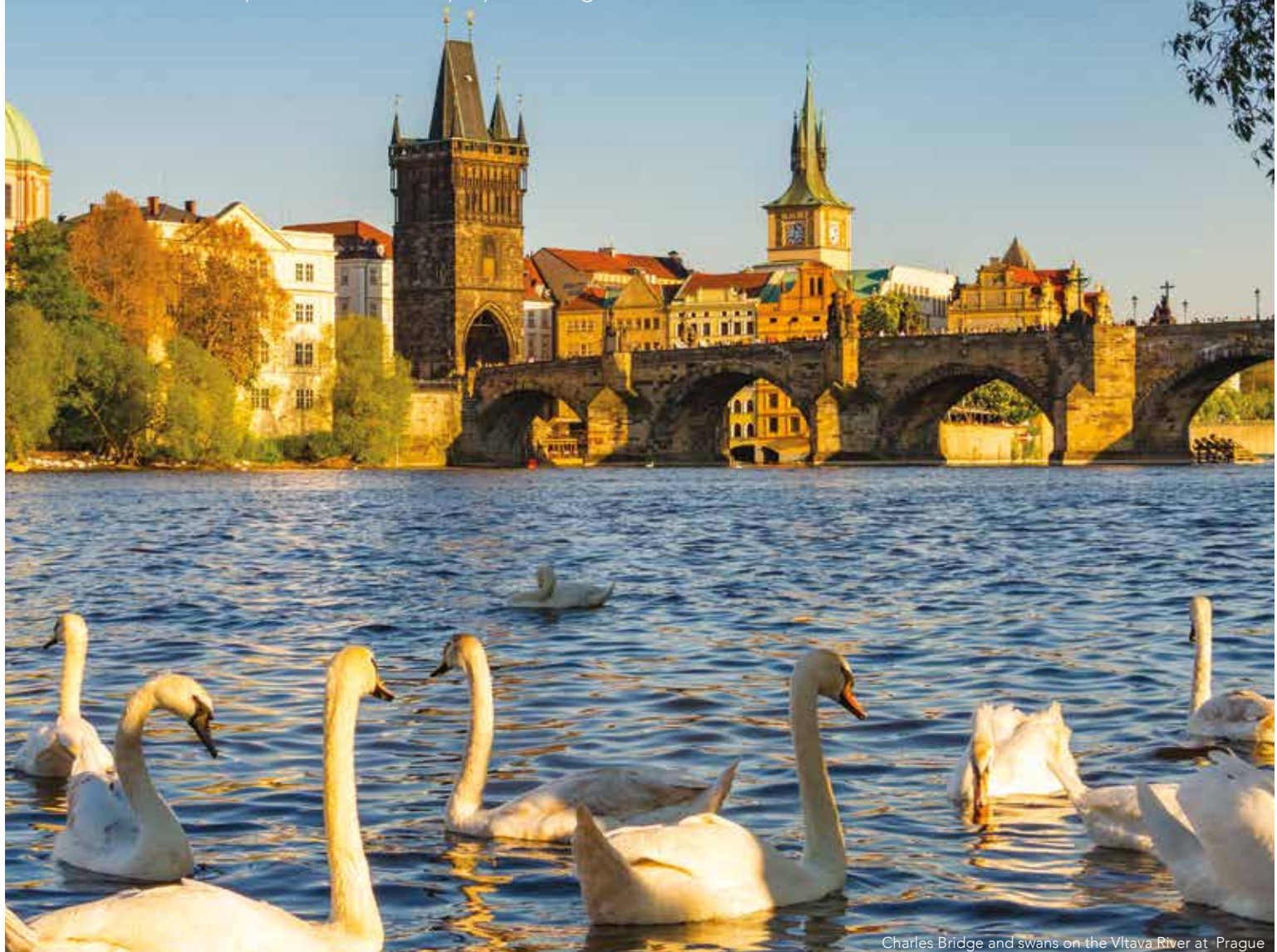
Charles Bridge and swans on the Vltava River at Prague

This is the perfect trip for those who enjoy seeing something different every day. In addition to discovering the vibrant city of Berlin and the graceful Czech capital of Prague, we also explore the culturally rich city of Dresden, often referred to as the 'Florence of the Elbe'. Other highlights include the famous porcelain producing town of Meissen, Luther's hometown of Wittenberg and historic Magdeburg. When not exploring ashore, there is ample time to relax on board witnessing some beautiful scenery as we sail along the Elbe, one of Europe's most unspoiled rivers. Especially scenic is Saxon Switzerland, one of the most spectacular natural landscapes in Europe where the Elbe has cut a deep valley through sandstone rocks creating a picturesque and rugged landscape. Our floating hotel, the MS Elbe Princesse will transport you in considerable comfort and the slow speed of the vessel will allow you to absorb the changing landscape of town and country and observe everyday life along the river: