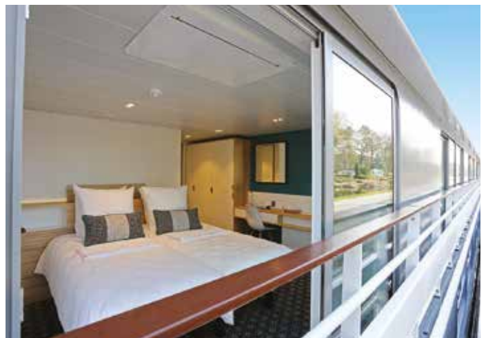
Upper Deck Cabin with French Balcony