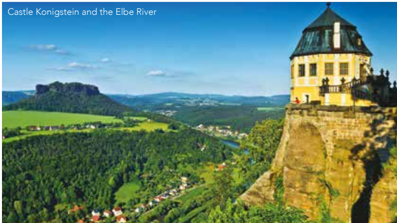
Castle Konigstein and the Elbe River