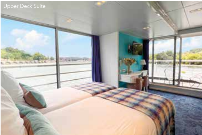
Upper Deck Suite