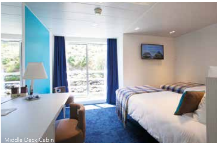
Middle Deck Cabin