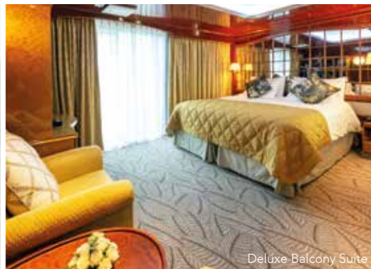
Deluxe Balcony Suite