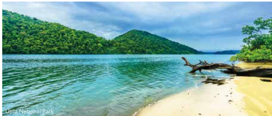
Utria National Park

Our coastal cruise along the Pacific shores of South America will be dominated by the ever present Andes as we make our way from central Chile to Panama City. This is one of the world's great expedition cruises and few regions in the world offer the diversity and ecosystems of those found in this intriguing part of South America. From the towering snow-capped Andes to the barren coastal desert and tropical forests with an amazingly rich biodiversity of flora and fauna, the landscapes are unparalleled.