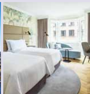
Deluxe Twin Room