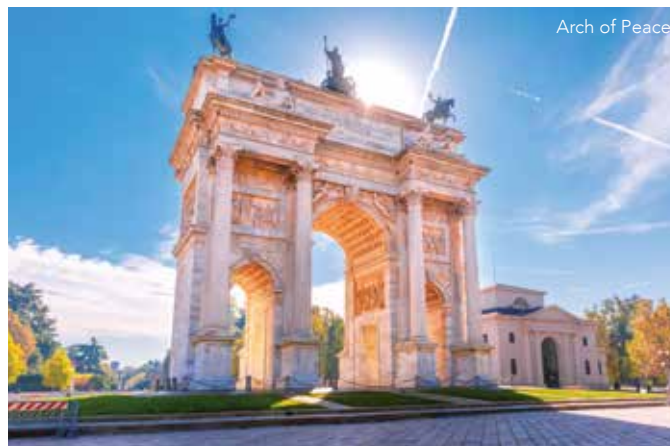
Arch of Peace

Day 5 Milan to London. After breakfast we transfer to the airport for our scheduled flight to London. (B)