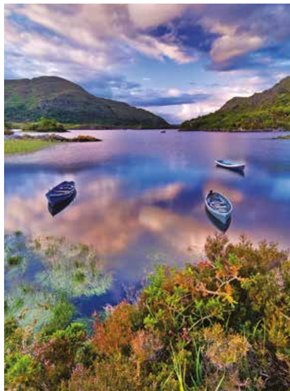
The Lakes of Killarney