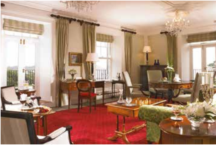
Princess Grace Living Room - Main House