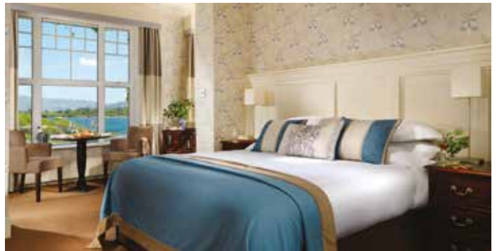
Superior Double with Sea View - West Wing