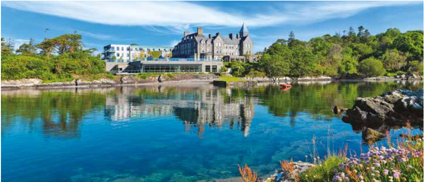
The hotel and gardens