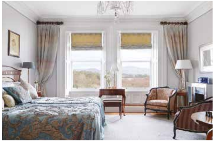
Manor Suite - Main House