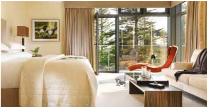
Balcony Suite - West Wing