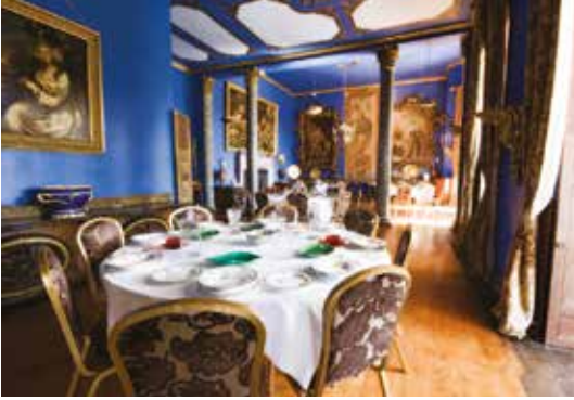
Bantry House interior