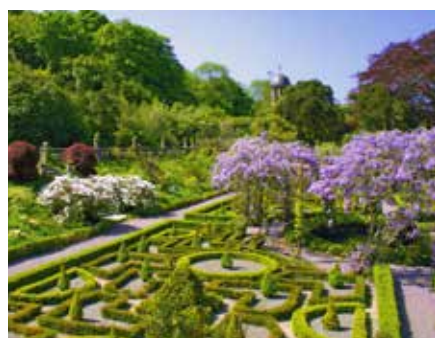
Bantry House Gardens

Day 4 Lakes of Killarney & Muckross House. Morning excursion to the Killarney National Park