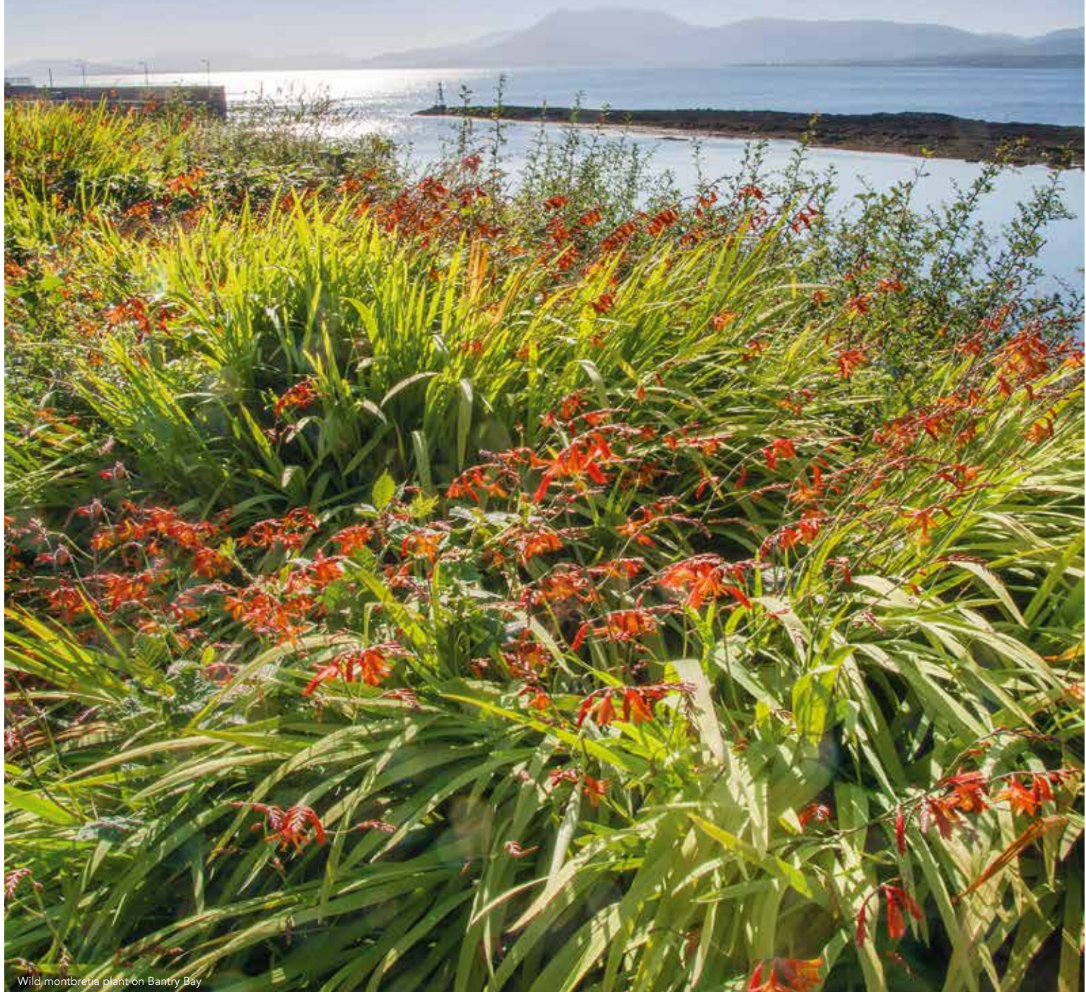
Wild montbretia plant on Bantry Bay

Together with our good friends at London Festival Opera we can offer seven days of absolute bliss. There will be time to relax and enjoy the hotel's excellent facilities as well as guided trips to some of Kerry's and West Cork's famous gardens. We will explore the 'Ring of Kerry' and drive over the mountains to Bantry House and Gardens. Here, after a guided tour of the gardens, we will enjoy a performance by London Festival Opera in the grand setting of Bantry House. Other highlights will include a visit to Garnish Island in West Cork, a spectacular garden of almost sub-tropical splendour and Muckross House by the Lakes of Killarney. In the main the tours will be limited to half days in order that you may enjoy the Parknasilla Resort and its breathtaking beautiful position.