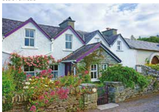
Cottages in Kenmare