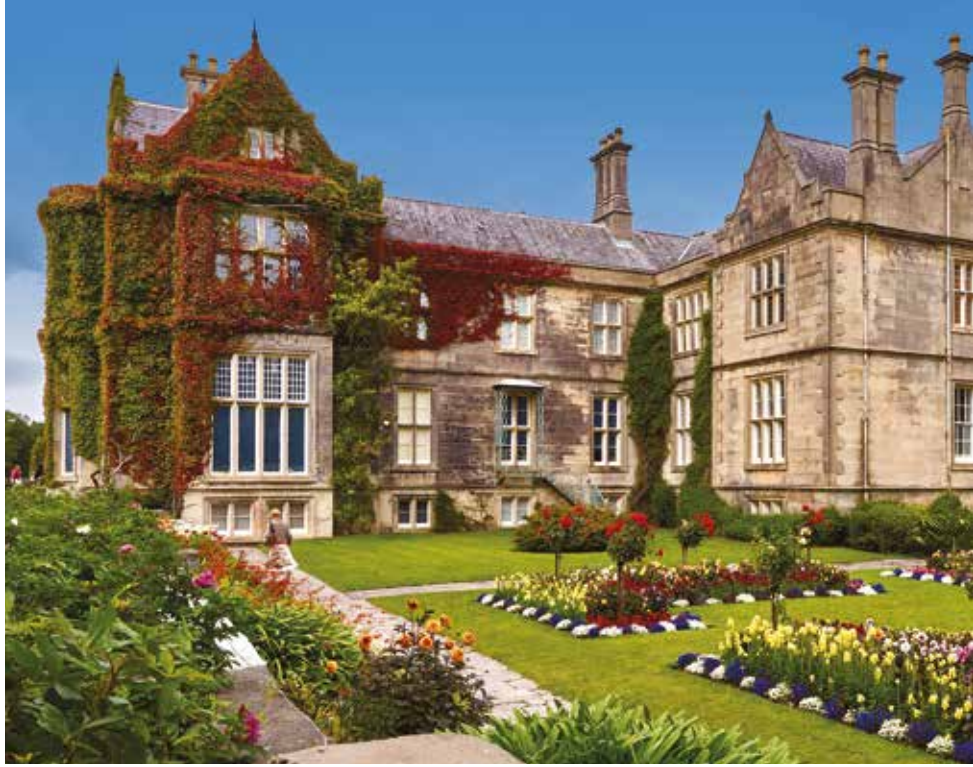
Muckross House and Gardens