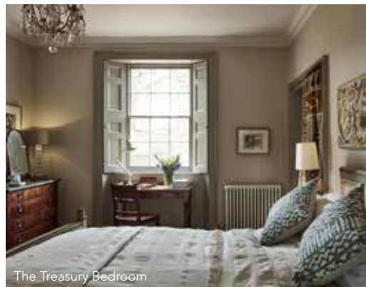
The Treasury Bedroom