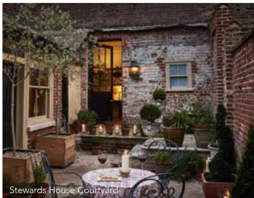
Stewards House Courtyard

The Stable Block, dating from the 1740s, is located between the Main Hall and the walled garden and is undergoing significant restoration. Accommodation here will include four rooms on the first floor, a studio room and double room on the ground floor, as well as a self-contained cottage. All will feature the same carefully curated period furniture, luxurious Vispring sprung beds and spacious bathrooms with walk-in showers. Further details and photos of these rooms will be available once renovation work is completed, expected later in 2026.