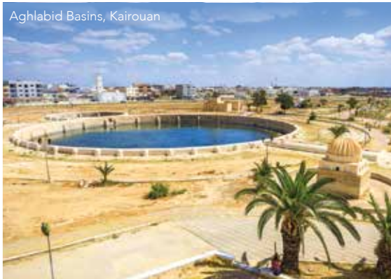
Aghlabid Basins, Kairouan