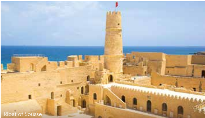
Ribat of Sousse