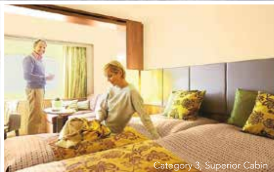
Category 3, Superior Cabin