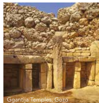
Ggantija Temples, Gozo

Day 6 Valletta. Today is free for you to enjoy the facilities of our wonderful hotel or for further exploration. This evening we will gather for our Farewell Gala Dinner