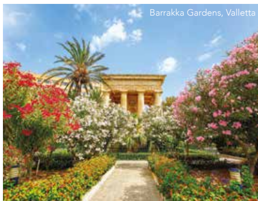
Barrakka Gardens, Valletta