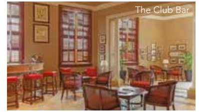
The Club Bar