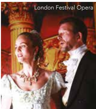
London Festival Opera

Regular travellers with us will be aware that each year we offer a number of trips with a strong musical theme and we are delighted to continue to offer our popular Malta tour in our musical repertoire for 2019. The Maltese Islands are quite literally one big open-air museum and during our week long stay we will spend time exploring the 7000 years of history. Visit palaces and cathedrals, wander along cobbled streets and soak up the timeless atmosphere. Our guided excursions have been arranged to allow adequate time to explore Malta's heritage with excellent local guides.