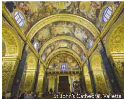
St John's Cathedral, Valletta