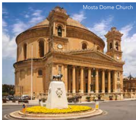
Mosta Dome Church