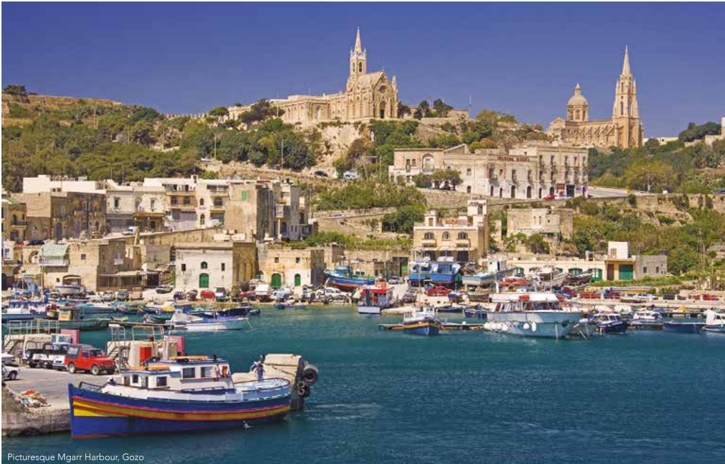
Picturesque Mġarr Harbour, Gozo

Regular travellers with us will be aware that each year we offer a number of trips with a strong musical theme and we are delighted to continue to offer our popular Malta tour in our musical repertoire for 2019. The Maltese Islands are quite literally one big open-air museum and during our week long stay we will spend time exploring the 7000 years of history. Visit palaces and cathedrals, wander along cobbled streets and soak up the timeless atmosphere. Our guided excursions have been arranged to allow adequate time to explore Malta's heritage with excellent local guides.