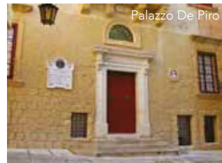
Palazzo De Piro