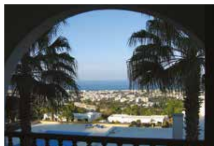
View over Kyrenia from hotel room halcony