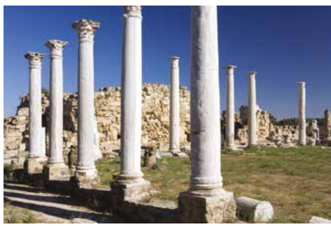
Gymnasium at the ancient site of Salamis