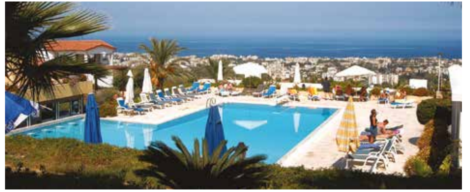
Swimming pool with views of Kyrenia

The facilities include a large restaurant with sea views, a bar with outdoor terrace, an outside swimming pool with bar, indoor swimming pool, lounge and library. There is also a complimentary daily shuttle service to and from the town and free Wi-Fi in the restaurant, lounge and pool area. An unusual feature of the hotel is the small museum which displays a private collection of rare artefacts from the archaeological history of Cyprus.