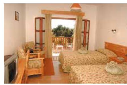
Hotel room with balcony