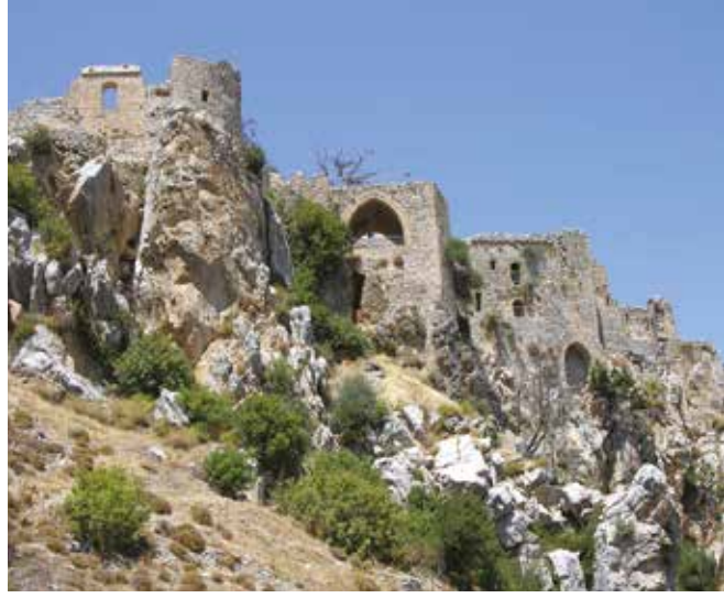
Ruins of St Hilarion Castle