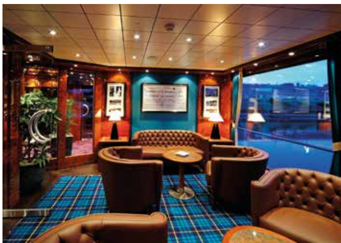
The Club (prior to refurbishment)