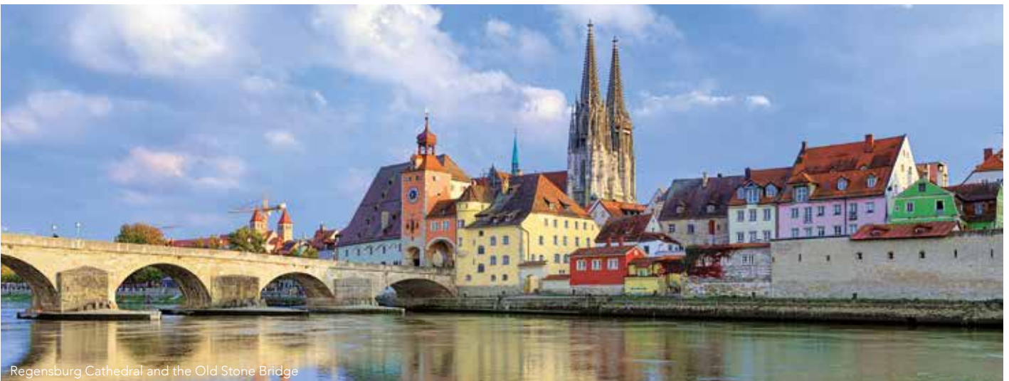
Regensburg Cathedral and the Old Stone Bridge