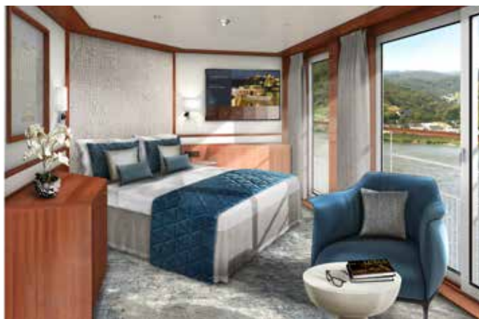
Illustration of Deluxe Cabin with French Balcony post-refurbishment