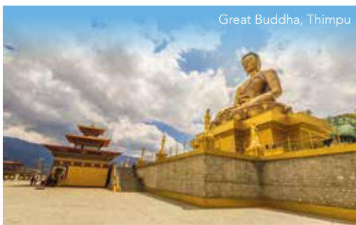
Great Buddha, Thimphu