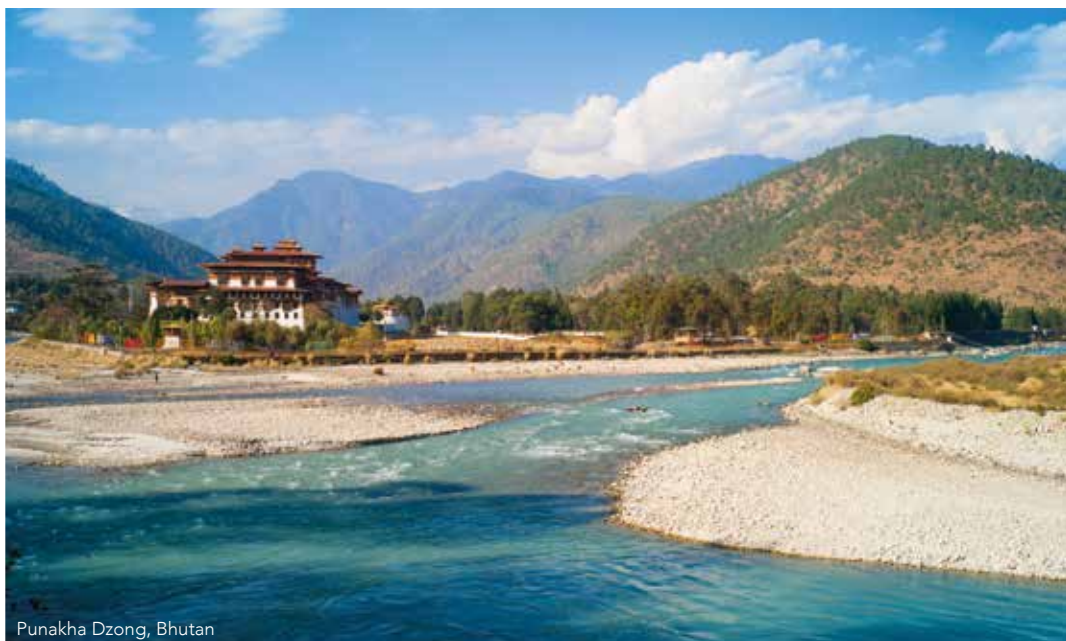
Punakha Dzong, Bhutan

Day 5 Kathmandu to Thimphu, Bhutan. This morning we transfer to the airport for our scheduled flight to Paro. The flight is one of the most spectacular in the entire Himalayas offering fascinating views and an exciting descent into the Kingdom. Bhutan's first gift to you as you disembark from the aircraft will be cool, clean fresh mountain air. On arrival we drive to Thimphu, Bhutan's capital city, and check in to our hotel, Le Meridien, where we have lunch before driving to the Great Buddha Dordenma statue offering wonderful views over the valley of Thimphu. Before this evening's dinner in the hotel, we will be joined by a Bhutanese scholar who will talk to us about Bhutan and Gross National Happiness. The Gross National Happiness philosophy serves as a beacon for Bhutan in its search for greater wellbeing and advancement of the Bhutanese people. (B, L, D)