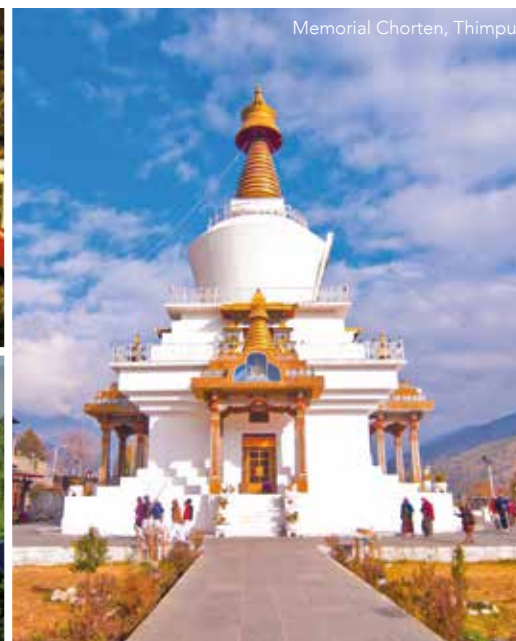
Memorial Chorten, Thimpu