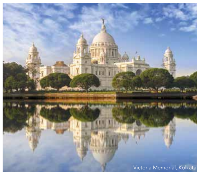
Victoria Memorial, Kolkata

Day 17 Kolkata to London. Check out this morning and transfer to the airport for our scheduled indirect flight to London. Arrive this afternoon. (B)