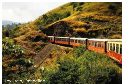
Toy Train, Darjeeling