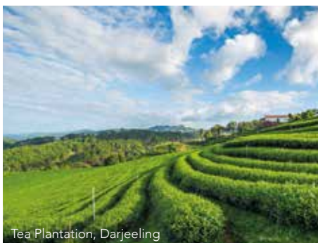
Tea Plantation, Darjeeling