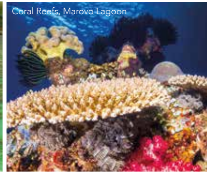
Coral Reefs, Marovo Lagoon