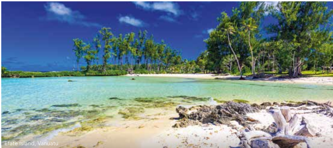
Efate Island, Vanuatu