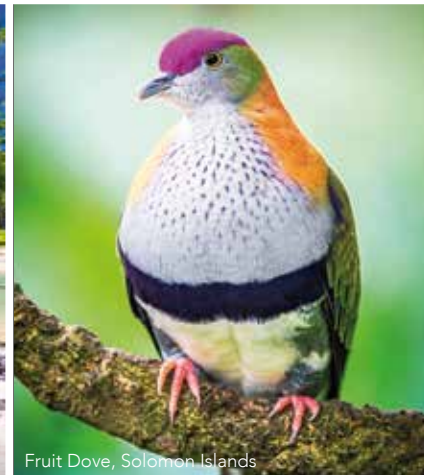
Fruit Dove, Solomon Islands

formations and white sand beaches, the lagoon waters shimmering in every shade of blue, turquoise and jade green. We have a full day here to explore the villages which produce some of the finest wood carvings in the region. We will also find a suitable spot to snorkel and swim from the beaches as well as enjoying nature walks in the local forests.