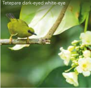
Tetepare dark-eyed white-eye