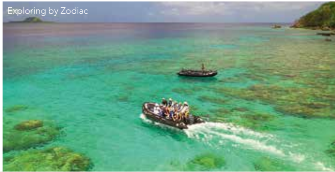
Exploring by Zodiac