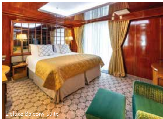
Deluxe Balcony Suite