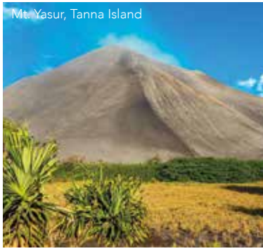
Mt. Yasur, Tanna Island