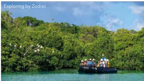
Exploring by Zodiac