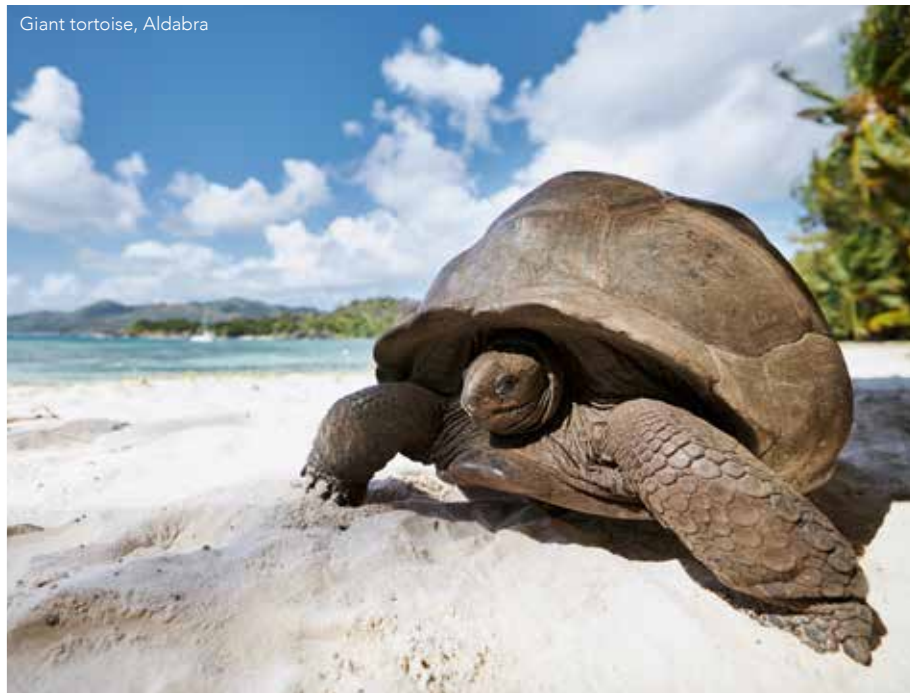
Giant tortoise, Aldabra

landing. From here there will be a choice of excursions to explore the local region. We will explore Marofandilia Forest, a protected area that is home to a number of species of lemurs, birds, reptiles and plants, and is managed by the proactive NGO Fanamby (the Malagasy 'arm' of Conservation International). During our visit we will take part in walks through the forest before a picnic lunch. We will then head to the Avenue des Baobabs. Of the eight baobab species in the world, six are endemic to Madagascar and here we will marvel at the majestic Grandidier's baobabs, a couple of dozen of which form a natural avenue. We will learn about the trees and their spiritual significance and have the opportunity to contribute to local reforestation efforts by planting a young baobab ourselves. Alternatively, if you would prefer a more leisurely day, there will be a morning tour to the Avenue des Baobabs which will return to the ship for lunch and a relaxing afternoon on board.