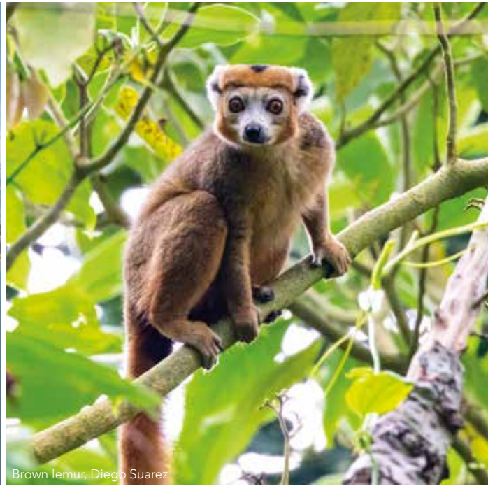
Brown lemur, Diego Suarez

The term ‘unique’ is an often overused description in the travel world but certainly applies to the island of Madagascar. The animals, plants, landscapes and people that make up this thousand mile long island are unlike anywhere else in the world. This extraordinary country long remained obscure as a destination and is still relatively unknown amongst even the most serious of travellers. There is minimal infrastructure in many parts of the island and for those wishing to explore in some depth, doing so by small ship, especially one as well-suited as the MS Island Sky is far preferable to exploring by any other means.