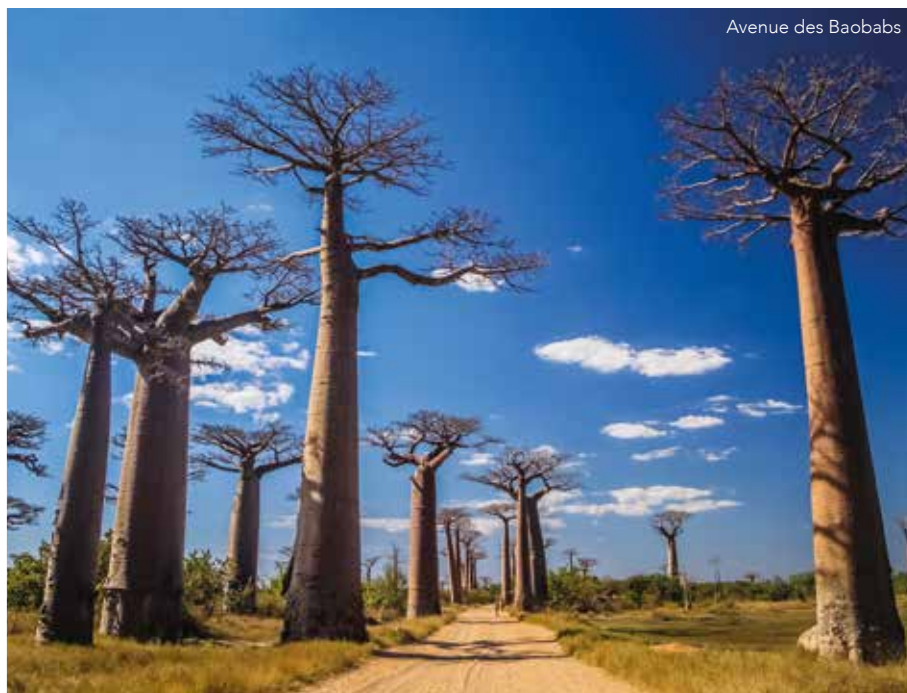
Avenue des Baobabs

for lemurs, chameleons and birds in the trees. Lunch will be served at the Antsanitia Resort, set in 22 hectare of grounds and located on a stunning section of coastline, and there will be an opportunity to swim or enjoy a walk along the beach, see the local fishing boats and visit the village before we return to the MS Island Sky.