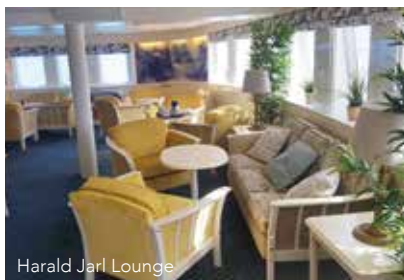
Harald Jarl Lounge