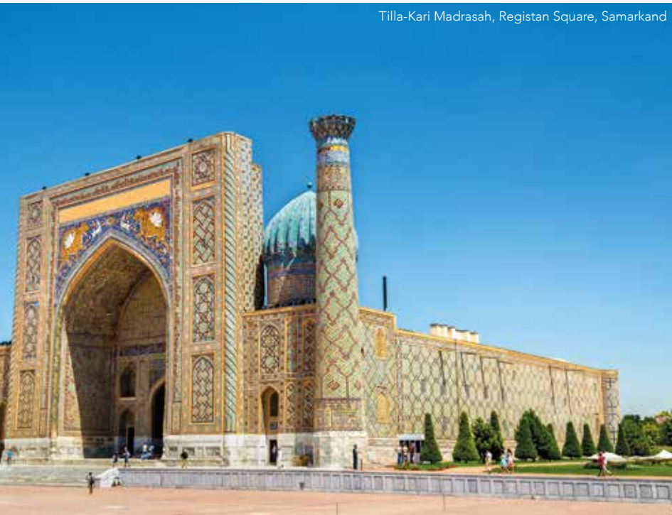
Tilla-Kari Madrasah, Registan Square, Samarkand