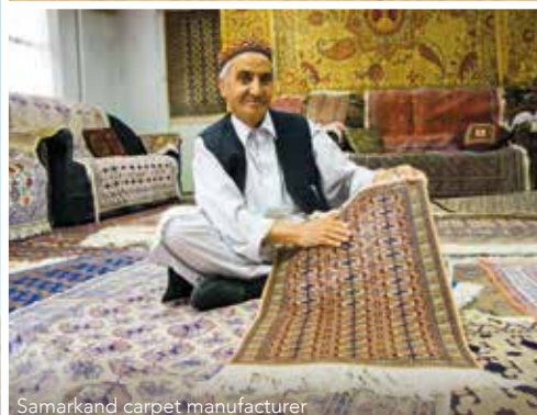
Samarkand carpet manufacturer