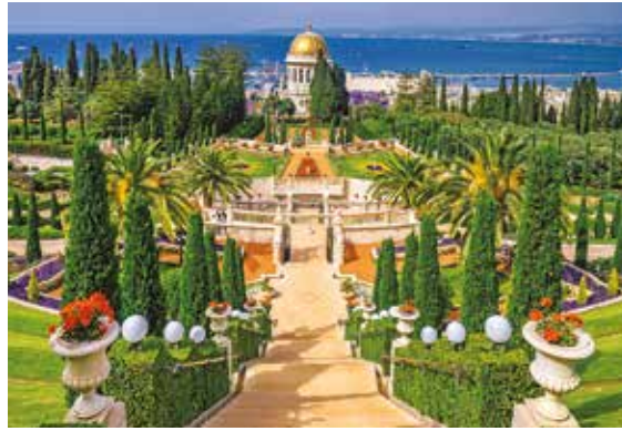
Mount Carmel and Bahai Gardens, Haifa