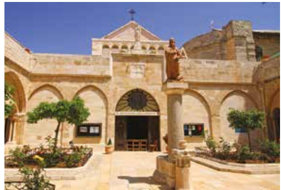
Church of the Nativity, Bethlehem

Banias Nature Reserve, home of the source of the River Jordan before continuing on to the Hula Valley, one of Israel's most beautiful regions and a major bird migration centre. Every spring and autumn an estimated 500 million birds pass through on their journeys between Africa, Asia and Europe. After lunch in a local restaurant return to the hotel to enjoy the facilities and beautiful surroundings. (B, L, D)