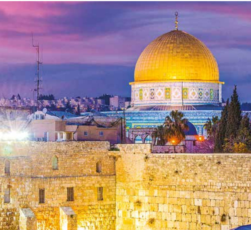
The Old City, Western Wall and the Dome of the Rock