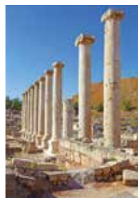
Ancient Beit Shean

desolate landscape and is often described as the most spectacular archaeological site in Israel. It was here that King Herod built a luxurious refuge complete with magnificent palaces, swimming pools and excavated rock cisterns to provide water supplies.