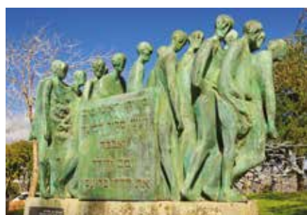
Holocaust Memorial at Yad Vashem

Day 6 Masada & the Dead Sea. Depart this morning on a full day excursion to the UNESCO World Heritage Site of Masada and the Dead Sea. Visit the Masada Fortress, located a little to the north of ancient Sodom. The mountain fortress of Masada looms high above the Dead Sea's