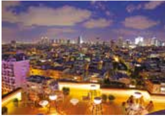
Tel Aviv from the Rooftop Balcony

For our escorted tour of Israel we have selected some of the finest accommodation available and will be staying at the following five-star properties: