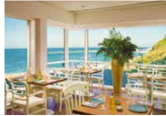
The Carlton on the Beach Restaurant