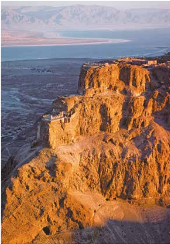
The Fortress of Masada