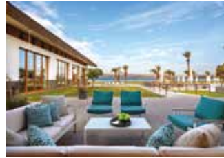
Hotel Grounds and the Sea of Galilee