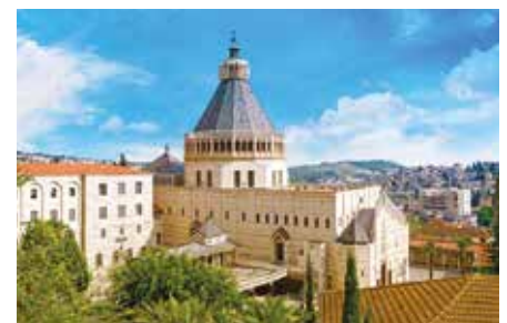
Church of the Annunciation, Nazareth

before transferring to Galilee to check in to the Setai Galilee for a two night stay. (B, L, D)