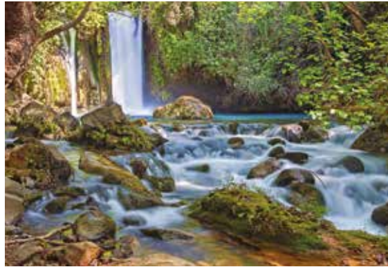
Waterfall, Banias Nature Reserve