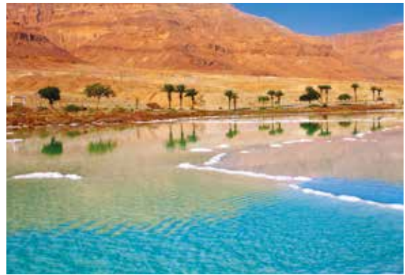
The Dead Sea